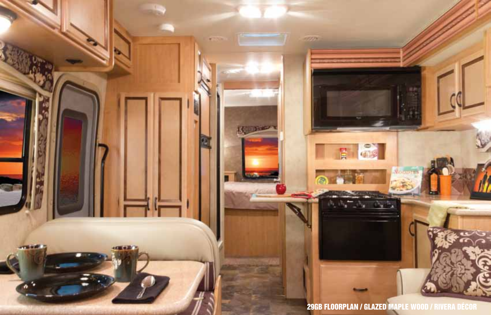
29GB FLOORPLAN / GLAZED MAPLE WOOD / RIVERA DÉCOR