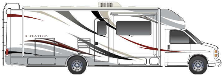
BLACK CHERRY PARTIAL PAINT