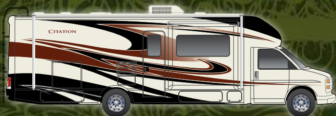
SANGRIA PEARL FULL BODY PAINT