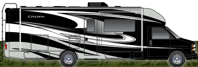
BLACK DIAMOND FULL BODY PAINT