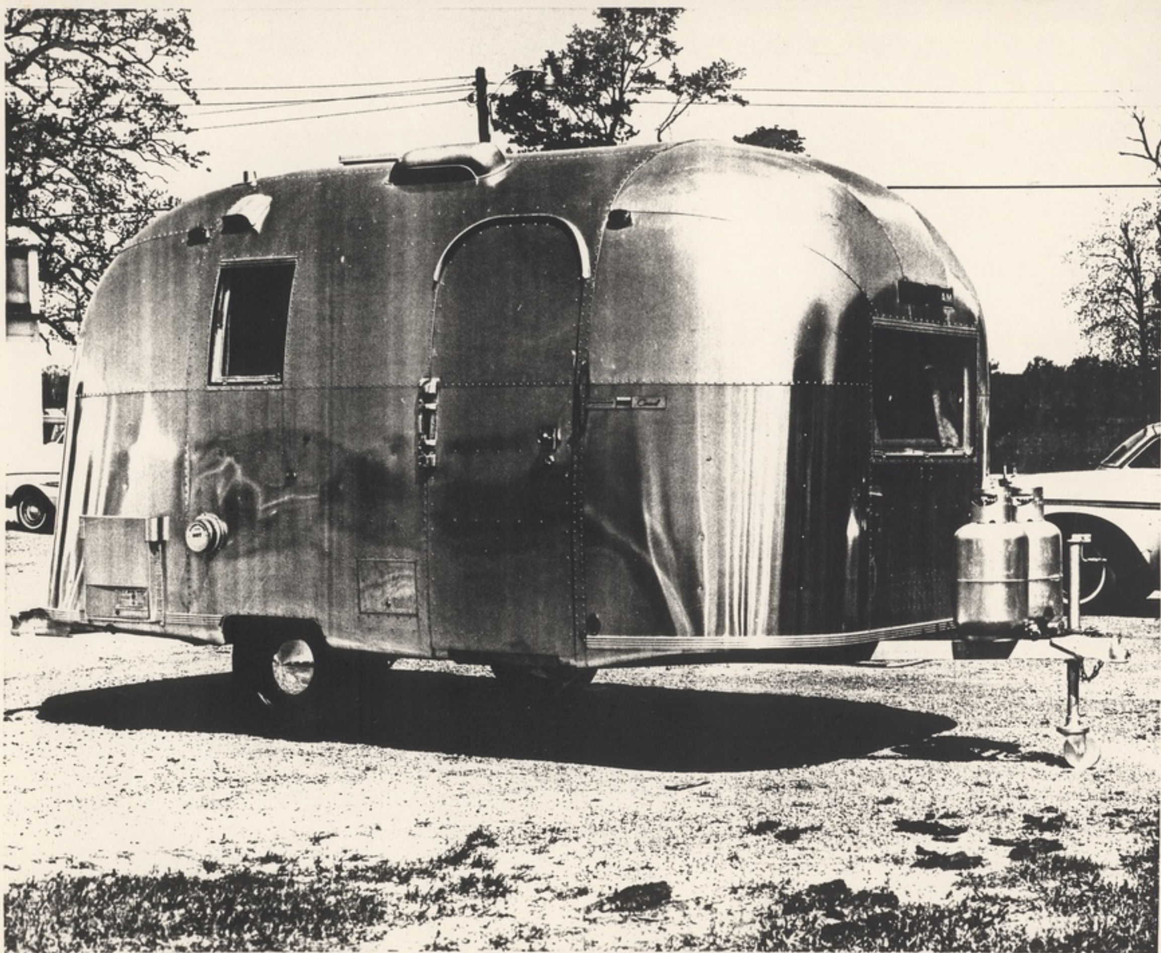
1967 17' Caravel