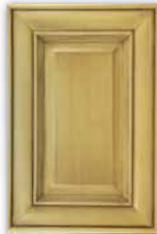
BAVARIAN CRÈME GLAZE