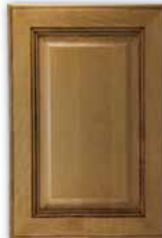
ALMOND MOCHA GLAZE