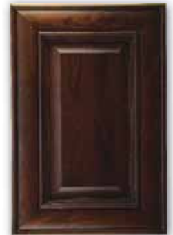
IMPERIAL CABERNET GLAZE