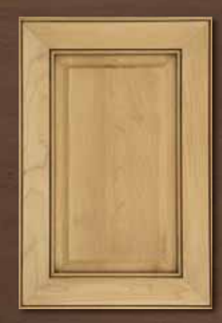
Castleton Pearl Glaze