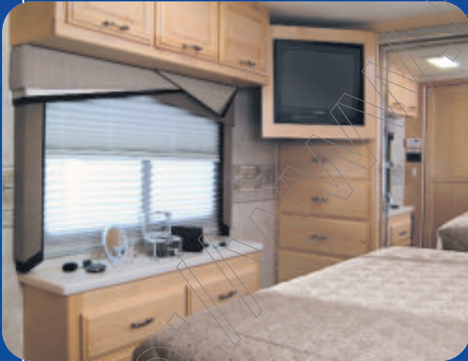
38 B BEDROOM SHOWN WITH ONYX INTERIOR AND CLEAR WHITE MAPLE WOOD

Bedroom storage space is the new order for the day thanks to a full wardrobe and optional base cabinet and overhead storage compartments. A large 20" TV swivels out and conveniently stows away when not in use.