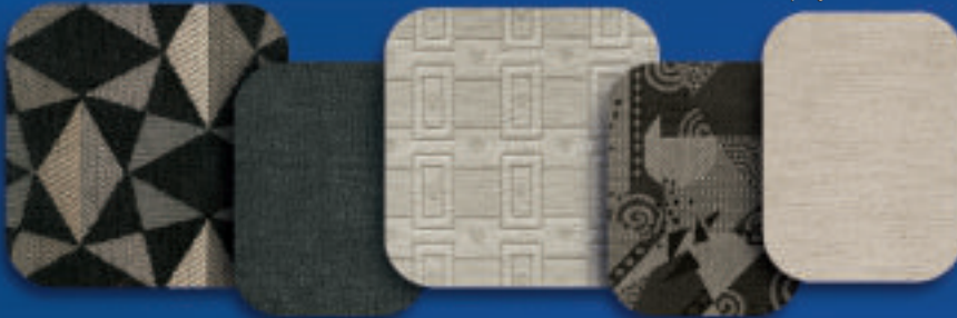
Living Room Coordinate