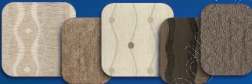
Living Room Coordinate