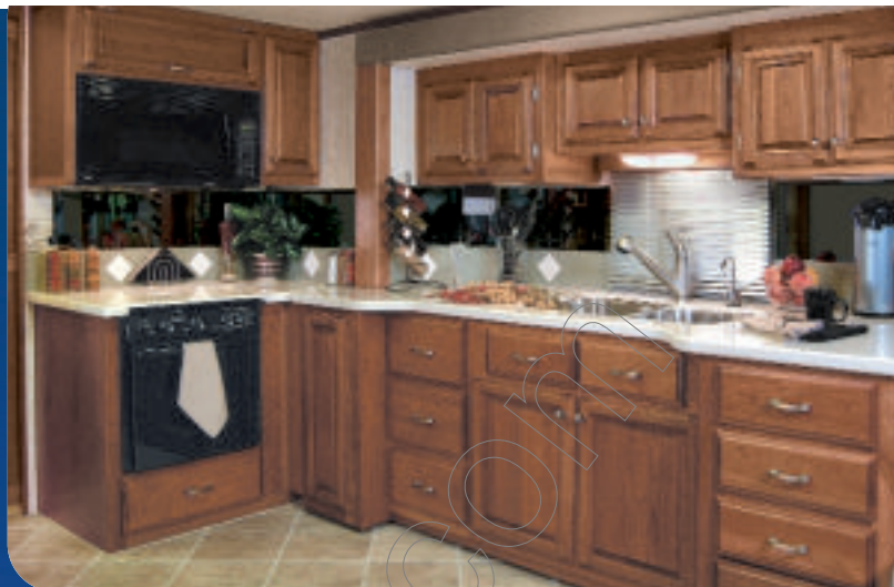
40 C SHOWN WITH TOPAZ INTERIOR & NATURAL WALNUT WOOD

Revolution once again leads the way with striking interior changes. Choose from nine wood and fabric combinations and ultra leather furniture with color coordinated inserts. In the galley area you'll discover newly designed cabinet hardware, solid surface backsplash and sealed oven burners.