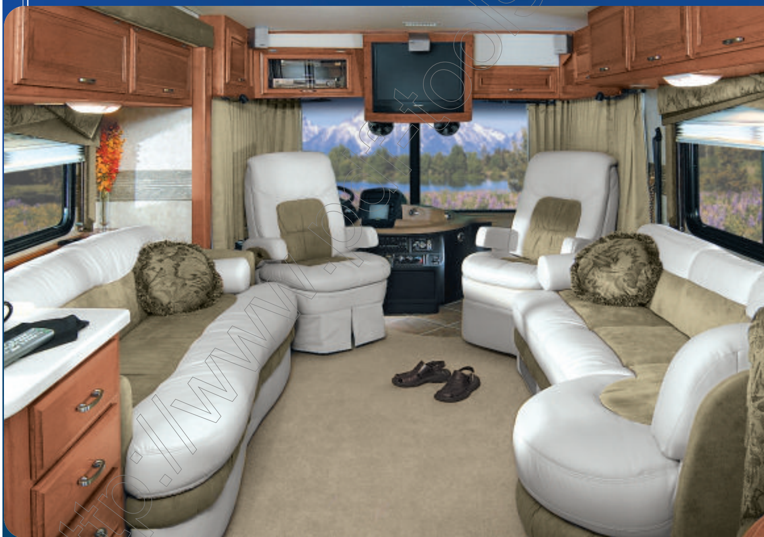
40 C SHOWN WITH TOPAZ INTERIOR & REGENCY CHERRY WOOD

From aft to bow, stem to stern and wall to wall, Revolution now comes with quality Fabrica carpeting, diagonally tiled floors in the galley and entryway, as well as padded vinyl ceilings. A new optional central vacuum system is now available to keep your cabin shipshape.