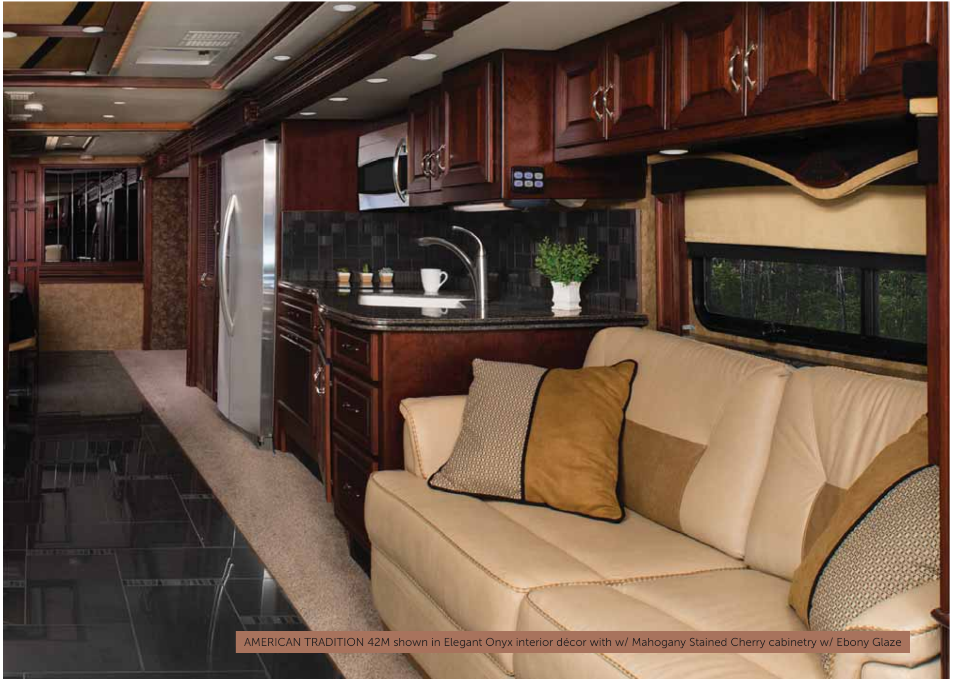
AMERICAN TRADITION 42M shown in Elegant Onyx interior décor with w/ Mahogany Stained Cherry cabinetry w/ Ebony Glaze