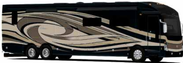
CHAMPAGNE & PEARL