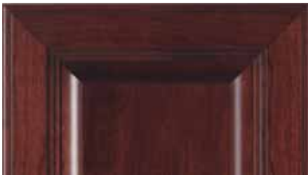
Mahogany Stained Cherry w/Ebony Glaze