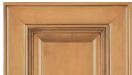
Almond Mocha Glaze