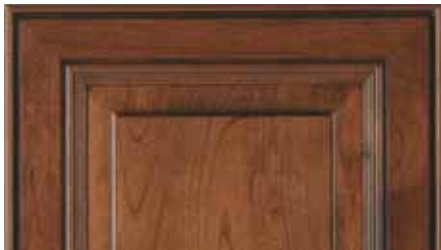
Regency Cherry w/Ebony Glaze