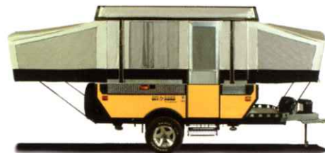
Mojave shown in "You Want a Piece of Me Yellow" exterior.