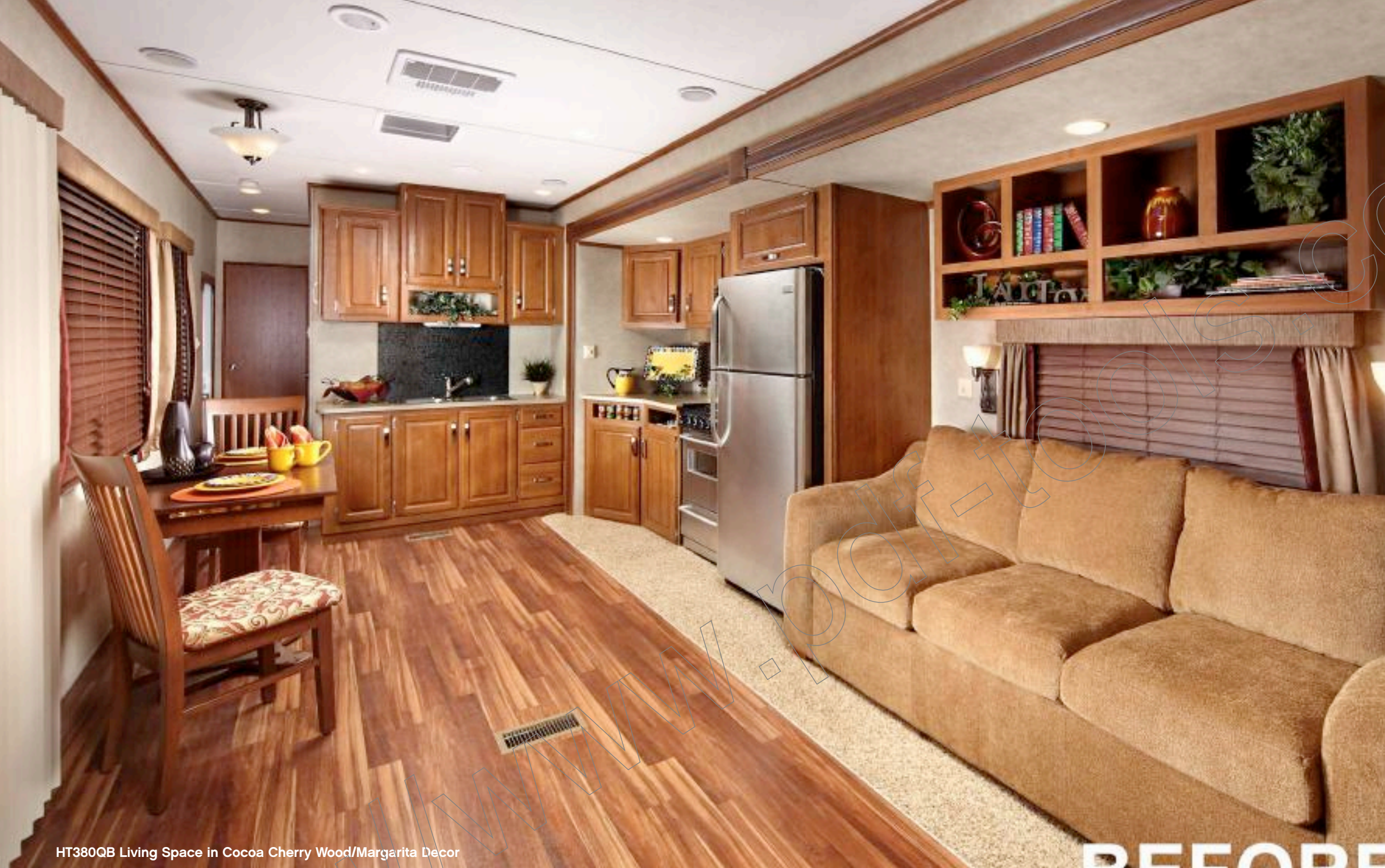
HT380QB Living Space in Cocoa Cherry Wood/Margarita Decor