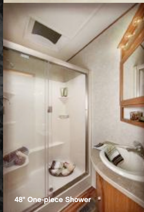
48" One-piece Shower