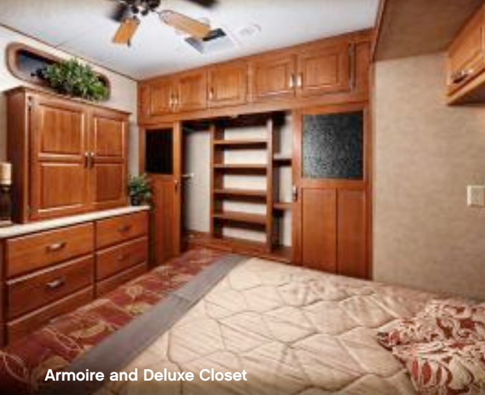
Armoire and Deluxe Closet