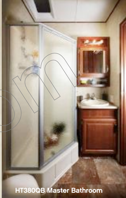
HT380QB Master Bathroom