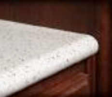
Optional Solid Surface Counters