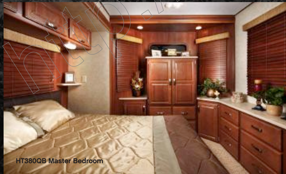
HT380QB Master Bedroom