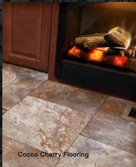
Cocoa Cherry Flooring