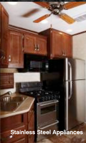
Stainless Steel Appliances

SHOULDN'T YOUR WEEKEND BE BOTH BEAUTIFUL AND COMFORTABLE?