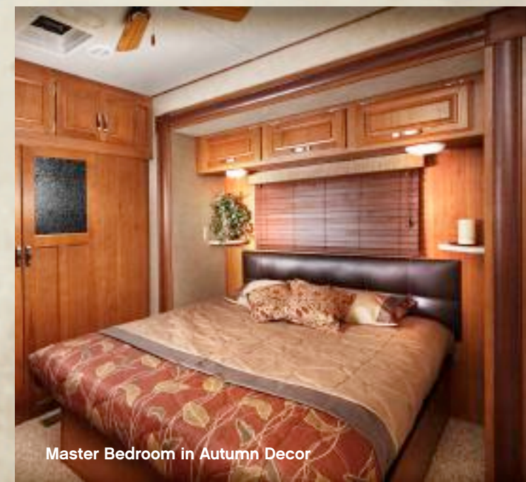
Master Bedroom in Autumn Decor

STYLE, CONVENIENCE AND PEACE OF MIND ARE DESIGNED INTO EVERY HAMPTON UNIT.