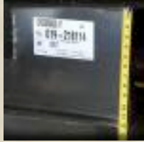
12" I-beam Construction