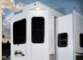
One-piece Molded Front Cap