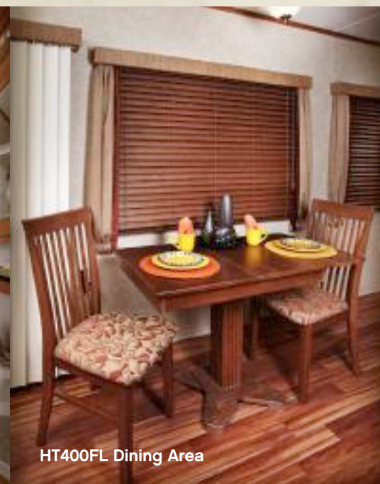
HT400FL Dining Area