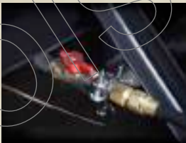
Reversible Main Shut-off