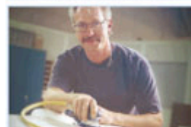
Built by the finest craftsmen in the Northwest