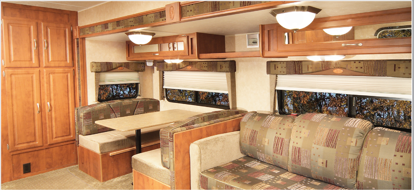
27FB-XL with Envy décor and cherry wood shown