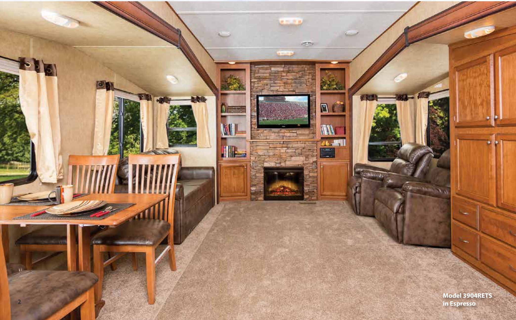
Model 3904RETS in Espresso

Watch as the stresses of job and school simply evaporate from your family.