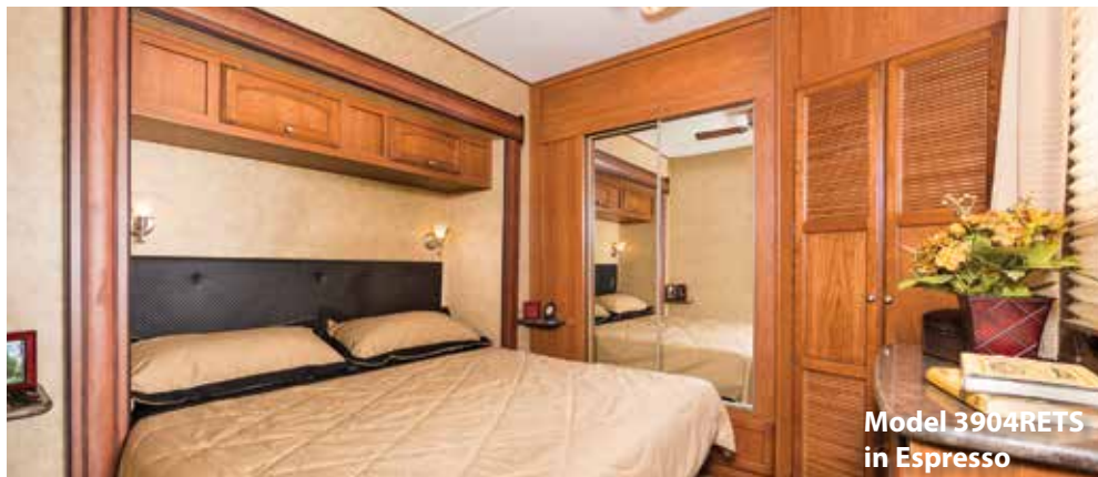
Model 3904RETS in Espresso