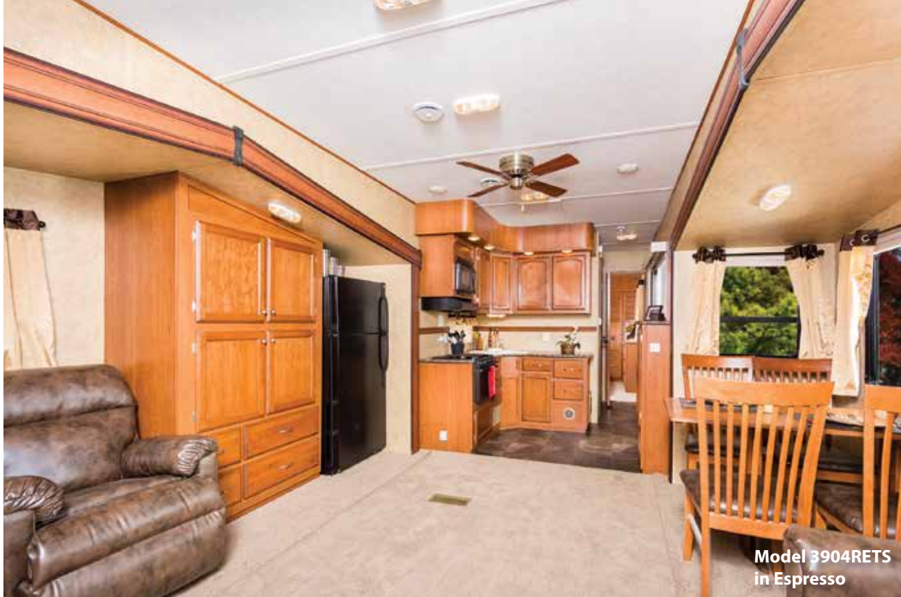
Model 3904RETS in Espresso