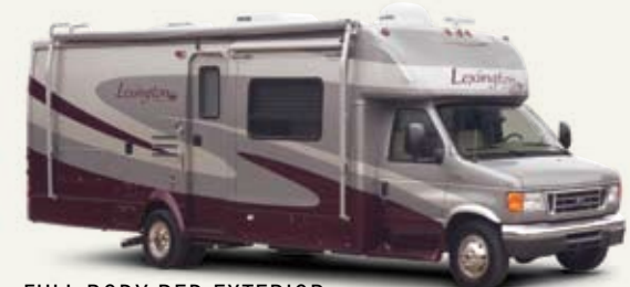
FULL BODY RED EXTERIOR