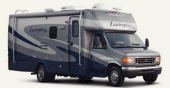
FULL BODY BLUE EXTERIOR