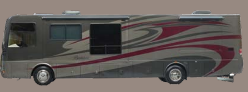
CHARCOAL RED EXTERIOR