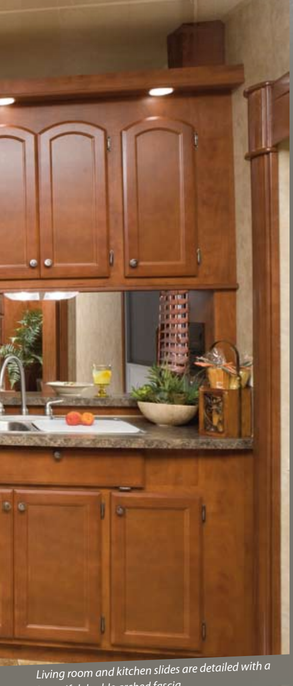
beautiful double arched fascia.