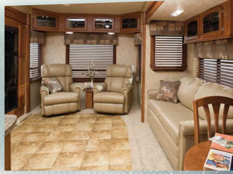
The hide-a-bed sofa with air mattress and La-Z-Boy™ recliners provide plush seating.