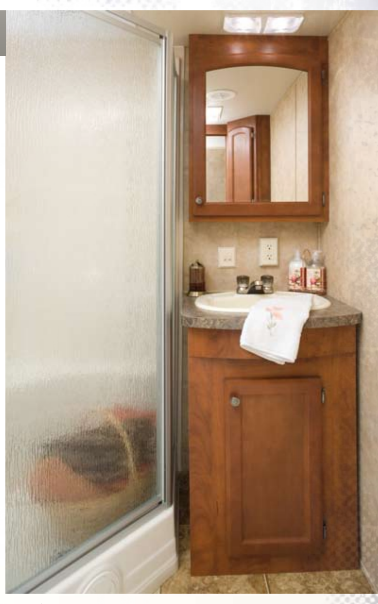
The wide-body gives you more elbow room in the bathroom area. Wider, larger bathrooms, along with residential fixtures, are a defining feature of the new Silverback GII.