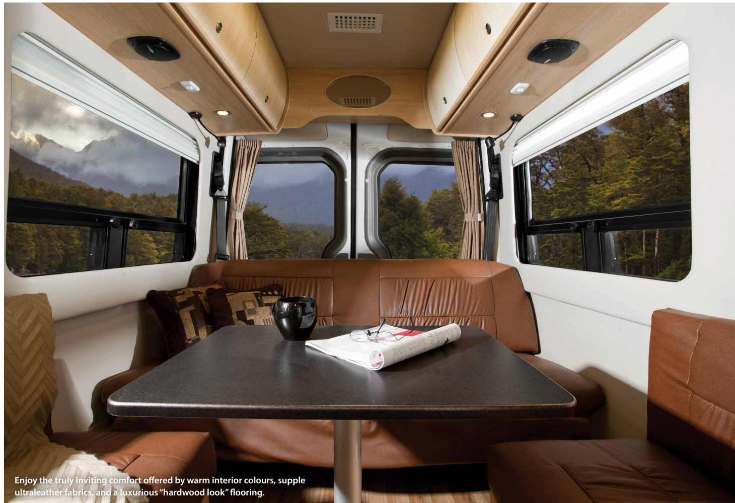
Enjoy the truly inviting comfort offered by warm interior colours, supple ultra-leather fabrics, and a luxurious "hardwood look" flooring.