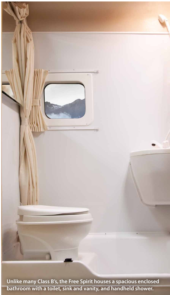
Unlike many Class B's, the Free Spirit houses a spacious enclosed bathroom with a toilet, sink and vanity, and handheld shower.