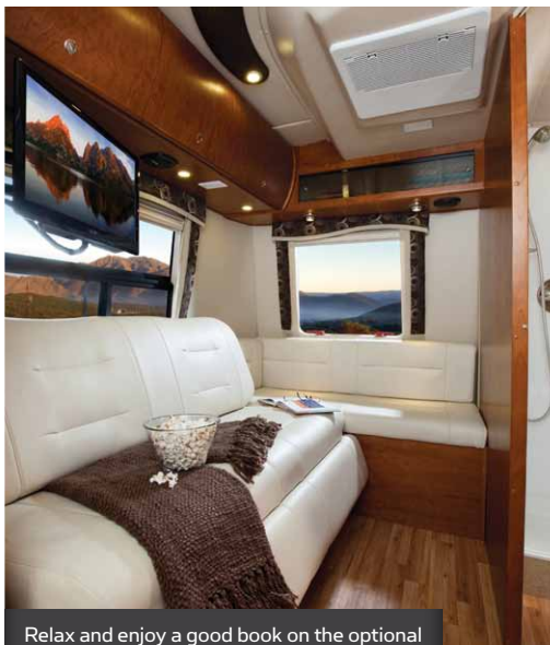
Relax and enjoy a good book on the optional rear power sofa, upholstered in Ultraleather.