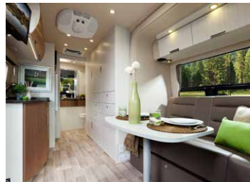
White Chocolate / Walnut (SS Only)