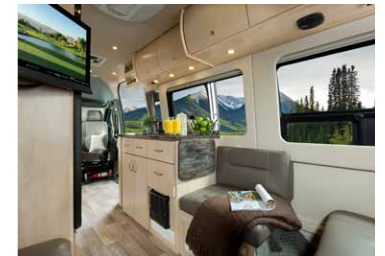
Sierra Maple (FS Only)