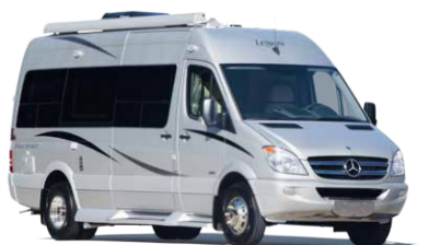
2013 Free Spirit