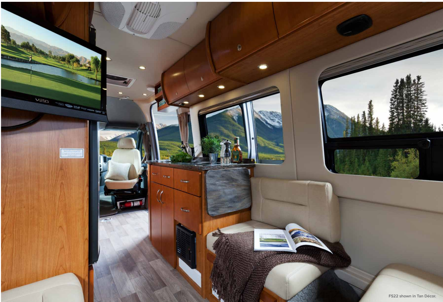
FS22 shown in Tan Décor.