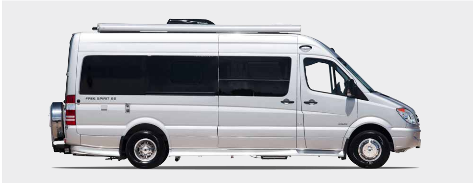
Free Spirit SS