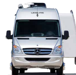
2013 Free Spirit SS