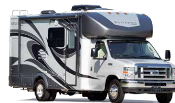
Regency GT by Triple E RV