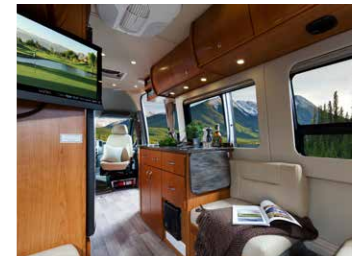
Cherry (FS Only)