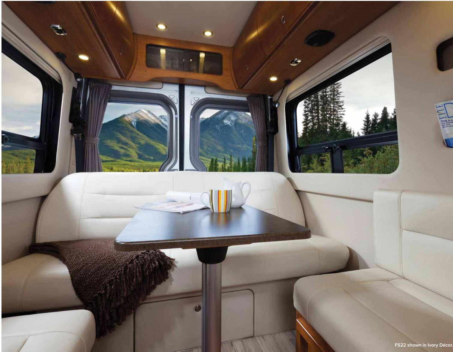
FS22 shown in Ivory Décor.