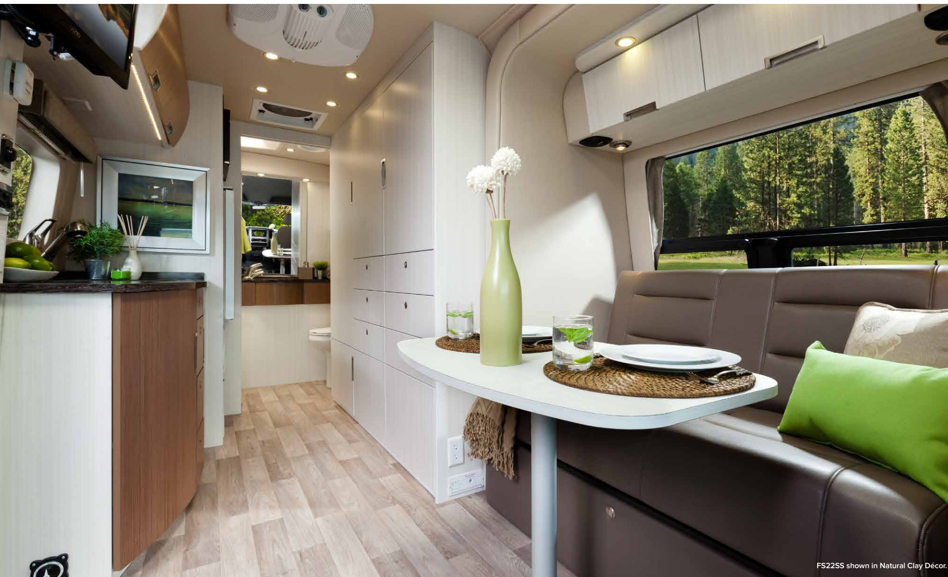
FS22SS shown in Natural Clay Décor.