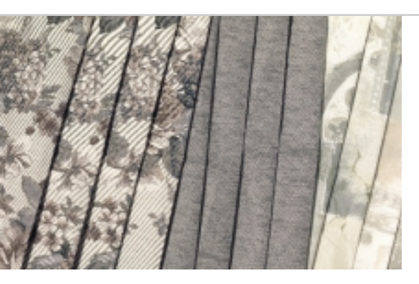
A Sofa B Chair C Bedspread