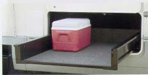
An optional Joey slide-out box provides convenient lighted storage for all kinds of odds and ends. Side door and flip-down panel at front of unit ensure fast and immediate access to stored items.