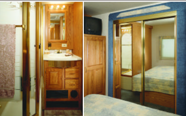
M370 WARDROBE SLIDE-OUT IN PACIFIC DECOR ▲