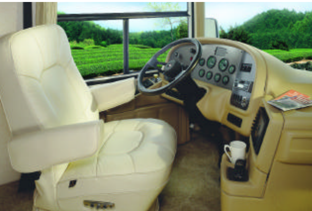
M370 COCKPIT IN FLEUR BOUQUET DECOR ▲

National RV is proud to introduce the Marlin® diesel pusher motor coach—designed for those seeking a full-featured luxury diesel pusher without breaking the bank.