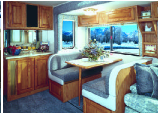
M370 HUTCH AND DINETTE IN PACIFIC DECOR ▲

coaches. Genuine Corian® solid counter surfaces and accents complement hand-crafted oak finished cabinetry throughout the coach. An innovative flush floor slide room design results in spacious, functional floorplans. Large dual pane windows keep Marlin's® interior bright and cozy. Thoughtful touches include a one-piece fiberglass tub/shower, porcelain toilet, a cedar-lined wardrobe, ceramic tile galley floor and designer fabrics throughout. During storage, dual rooftop solar panels keep the batteries charged for your next adventure.