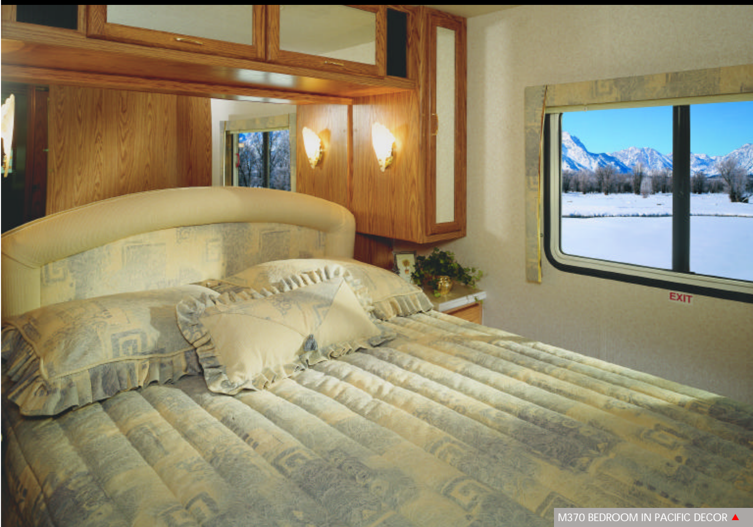
M370 BEDROOM IN PACIFIC DECOR ▲