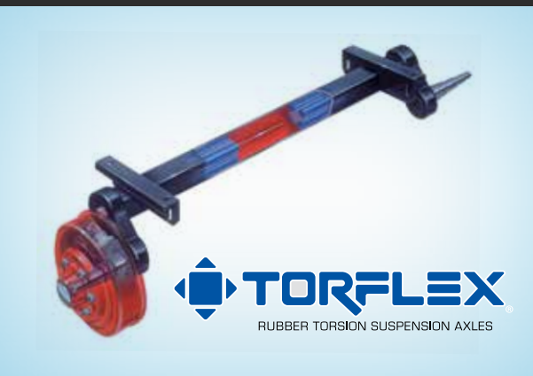
Solaires include a standard torsion axle with independent wheel suspension (N/A on Sevens) and includes rubber cushioning to eliminate the metal on metal contact.