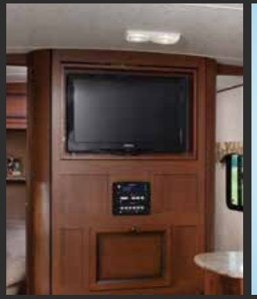
Swivel TV allows for viewing in both the bedroom and kitchen area of the trailer. Optional TV, sizes vary, see floorplans for available sizes.