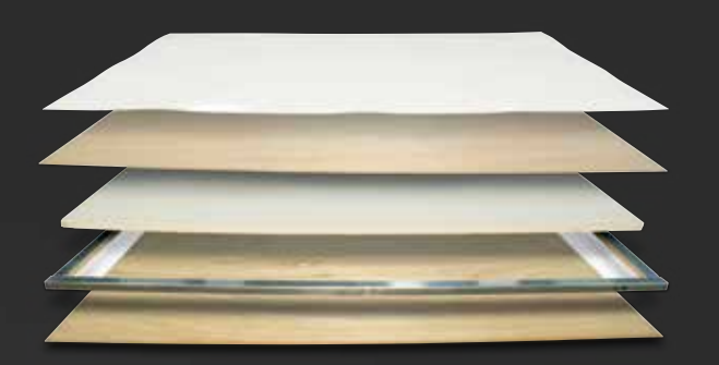
VACUUM-BONDED LAMINATED CONSTRUCTION Solaire provides a fully 6 sided vacuum-bonded trailer. Our walls, floors, roof, fronts and backs are all built vacuum-bonded to ensure a light weight strong structural trailer.

vaulted ceiling providing superior insulation and more interior height.