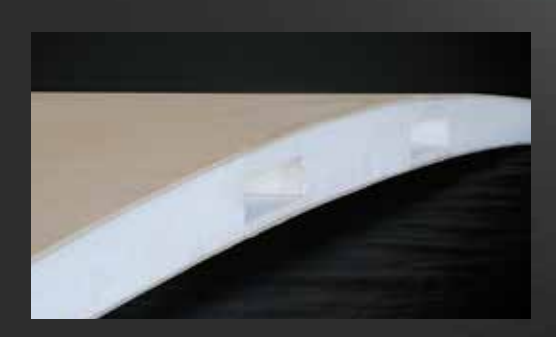
VAULTED RADIUS ROOF Structurally engineered materials makes our vacuum-bonded walls some of the strongest in the industry.