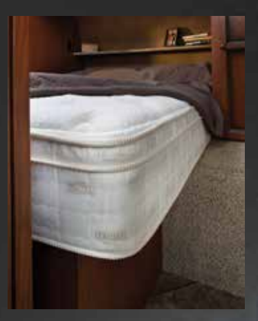
Optional Serta Trump® Mattress upgrade – provides a restful sleep with the most advanced 900 coil support system. The superior quality of the Serta Trump® helps provide the luxuries of home in your R.V.