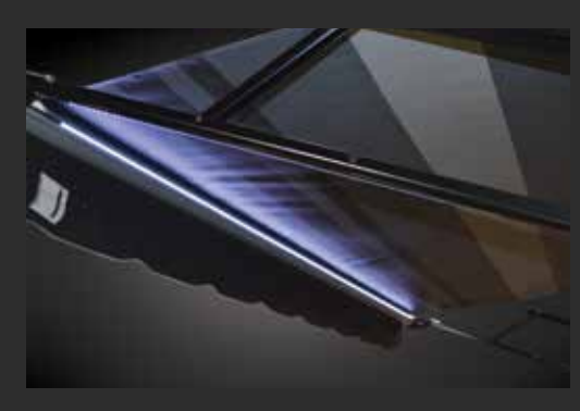
The electric awning with self-contained LED light strip provides quick and easy set-up.

OUR SIDE WALLS HAVE MASSIVE STRENGTH Vacuum bonded radius roof with