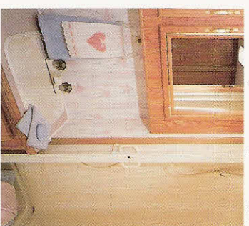
A full tub surround, deluxe foot-operated lavatory, wall switch operated lights, shower light, and a deep designer medicine cabinet are all standard. You also get a 6-gallon fast recovery hot water heater.