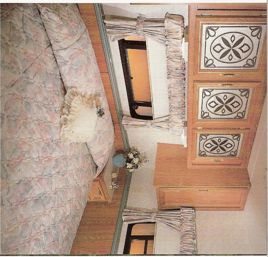
A Queen-size bed and bed spread are among the many standard features you'll appreciate.