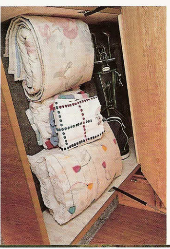
Hidden bedroom features include lots of storage thanks to a gas/piston lift bed storage compartment with a finished bed base inside and out.