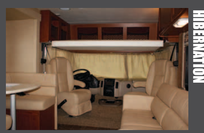
The Electric Overhead bed drops into place, without taking away from the living room seating. The front captain's chairs can still be used to watch TV or join the conversation in the living area with the bed down. A convenient curtain is provided to separate the bunk from the living room letting the kids get some shut-eye while the adults enjoy TV.