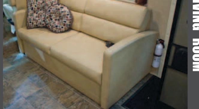
The leatherette sofa converts from a comfortable seating area to a sleepable bed. The secret...No big gap in the mattress area like the less expensive jack-knife sofas in other coaches.