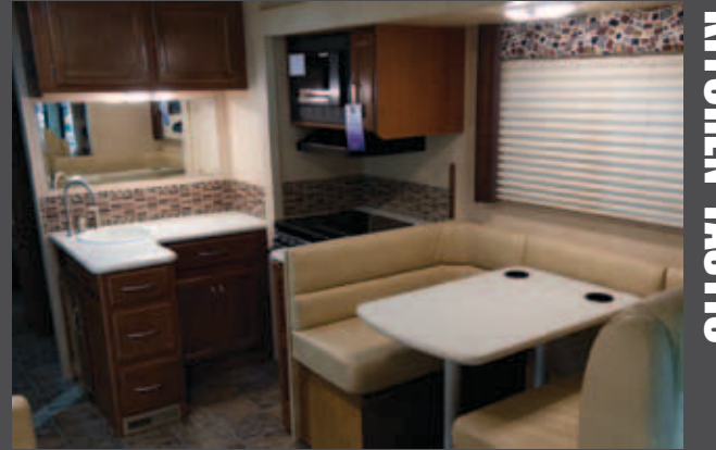
The wrap-around dinette is so inviting, whether dining or just relaxing. Look down below and notice the floor in the dinette is also linoleum, so if that glass of grape juice gets spilled, it's easy to clean-up and look mom...no stain!

Check-out the space in the kitchen. The microwave, sink and oven are all within arms reach. An ingenious slide-out pantry is tucked away and can be extended to provide additional counter space. The kitchen drawers open towards the living area, so when cooking, the utensils can be easily accessed.