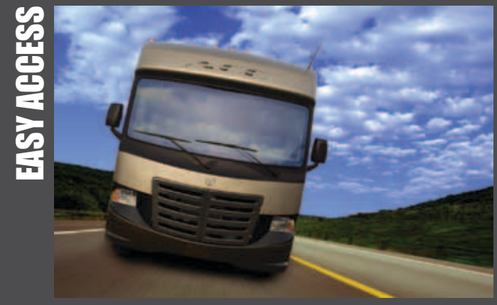
A "wide-opening" front hood on the A.C.E. makes other motorhomes look foolish. You don't need to be a contortionist if the wiper fluid needs refilled, motor oil needs topped off or brake fluid needs checked.

The "Camper's Corner" keeps all the waste disposal systems and LP appliances in a one spot, at the rear of the drivers side, well away from the camping area. The water heater and furnace is located "Below-floor" which makes sense, because it keeps hot exhaust away from kids and pets. Also, by keeping the main LP appliances below floor any noise intrusion is greatly reduced on the inside of the coach