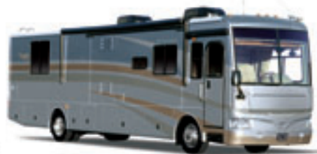
Optional Full Body Paint