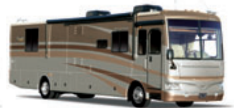
Optional Full Body Paint