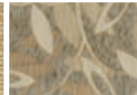
Dinette Cushions & Throw Pillows