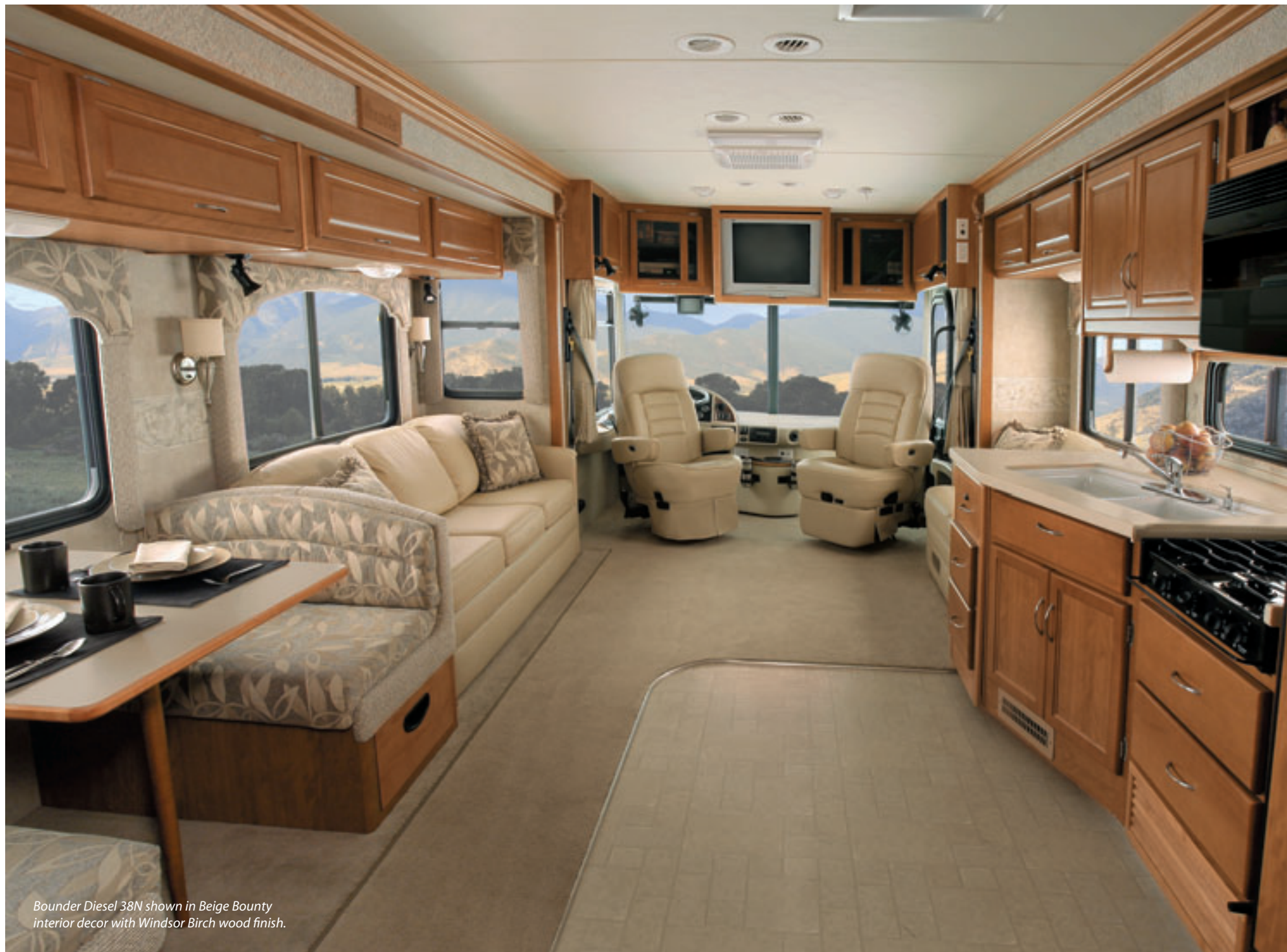
Bounder Diesel 38N shown in Beige Bounty interior decor with Windsor Birch wood finish.