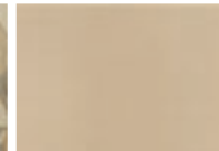
Ultraleather™ Driver & Front Passenger Seats