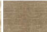
Bedspread, Pillow Shams & Throw Pillows