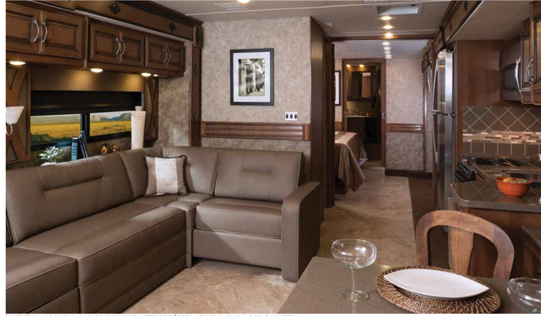
EXPEDITION 38S SHOWN IN BARBADOS SAND INTERIOR DÉCOR WITH CINNABAR WOOD CABINETRY

The moment you step inside, Expedition embraces you with calming comfort and beauty. A spacious, light-filled interior soothes the soul, while plentiful amenities fulfill every need. In your Expedition, relaxation is closer than you think.