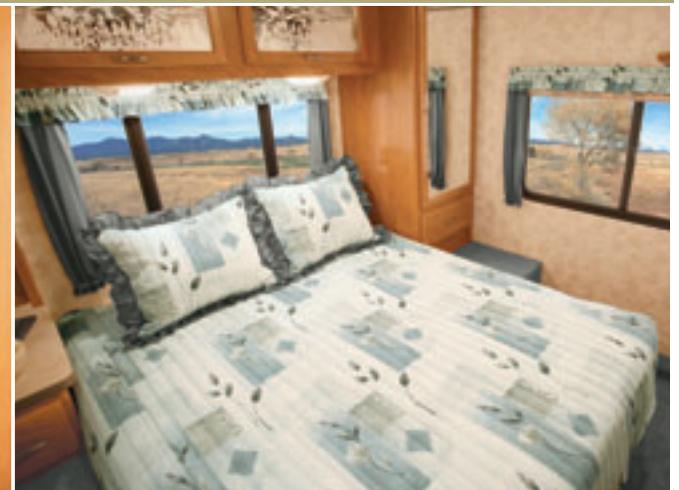
OVER-THE-BED STORAGE adds elegance and gives you ample room to store additional bedding or towels.