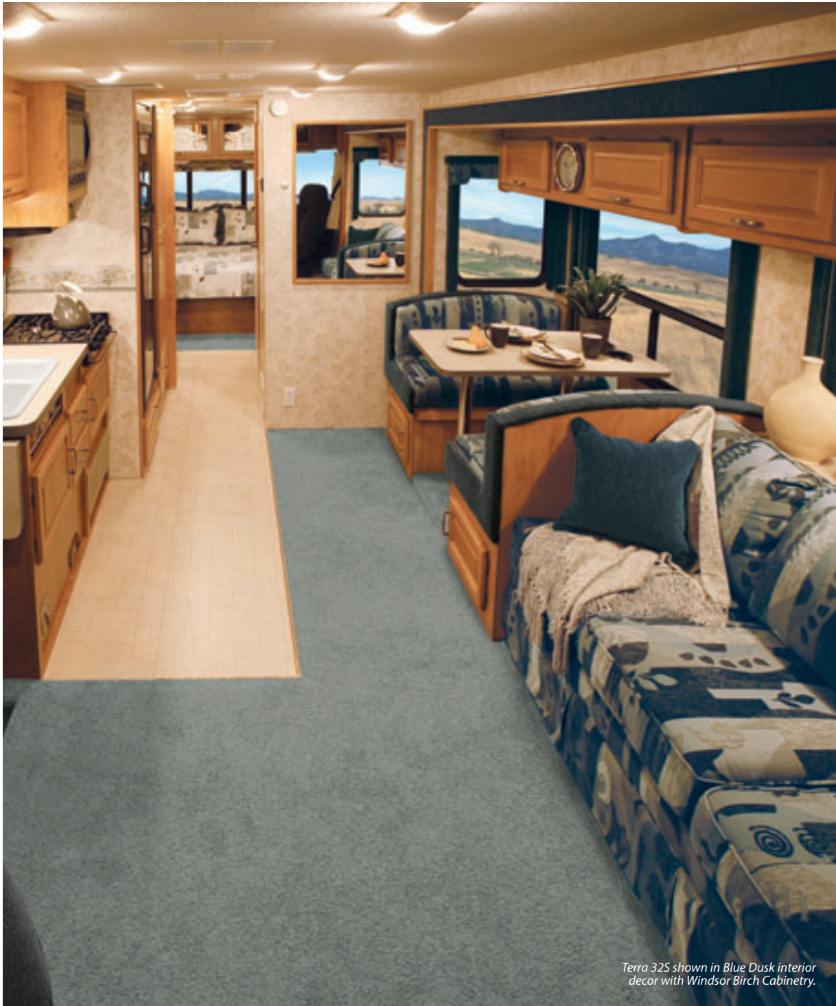
Terra 32S shown in Blue Dusk interior decor with Windsor Birch Cabinetry.

Terra offers a spacious environment with its smart and functional layout. There is plenty of room to relax in Flexsteel's® comfortable furniture, with a lifetime warranty on the frame, or enjoy the large dinette and well appointed galley.