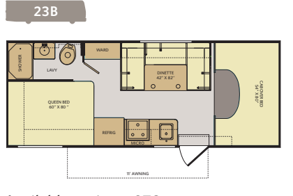
Available options: 078