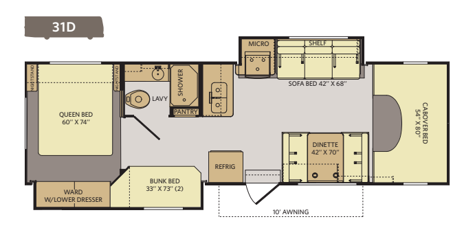
Available options: 079, 084, 097, 157, 167, 351, 860/864