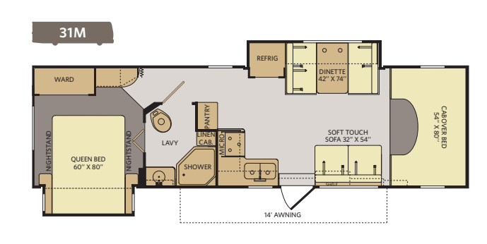
Available options: 079, 084, 167, 351