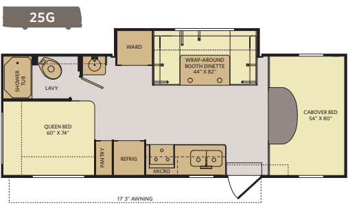
Available options: 079, 084, 167, 351