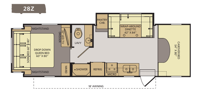
Available options: 079, 167, 351