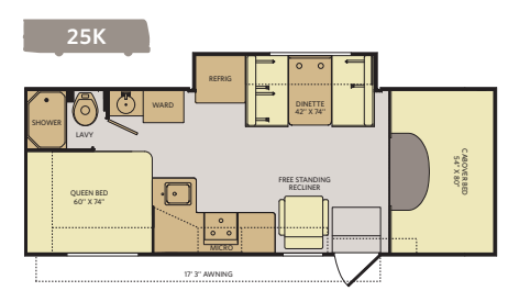
Available options: 078, 113, 160