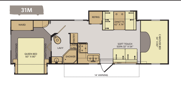
Available options: 078, 113, 160