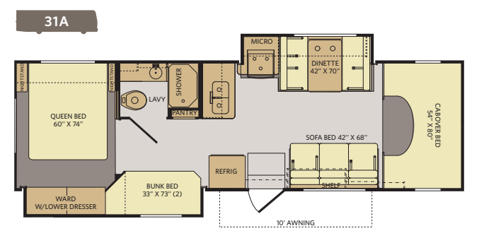
Available options: 079, 084, 097, 157, 167, 351, 860/864