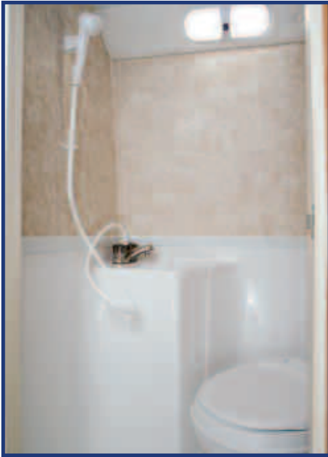
Complete bath facilities