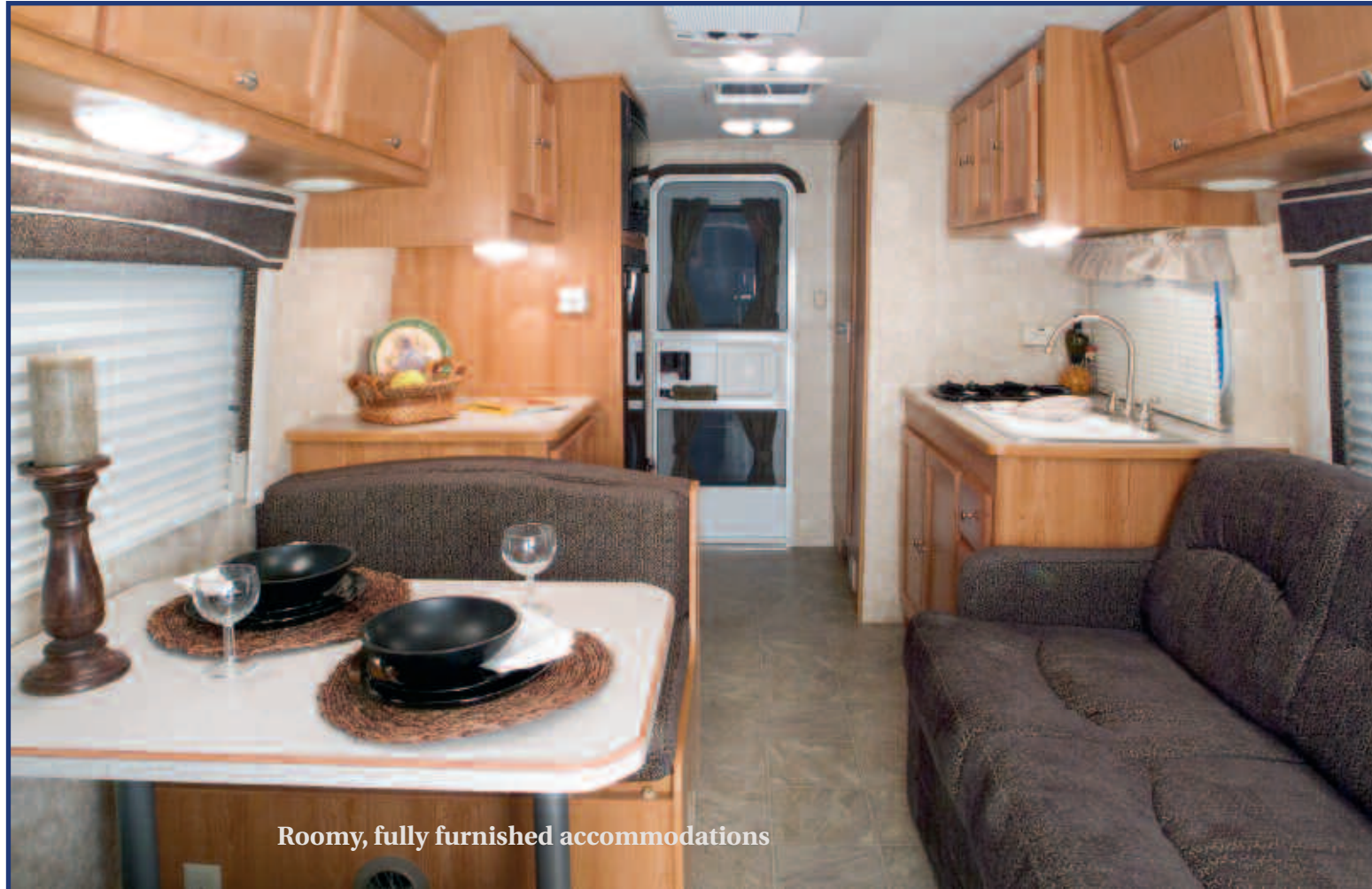
Roomy, fully furnished accommodations