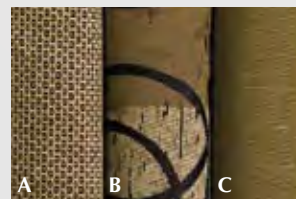
A. Brass Ring