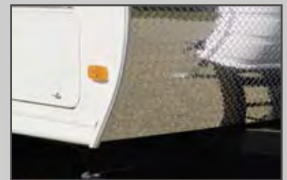
Diamond plate protected front wall adds protection against road elements and adds stylish flair.