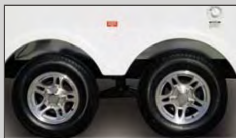
Aluminum wheels enhance the stabilization axle design. EZ lube axles are easy to maintain.