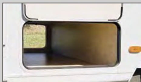
Large pass-thru storage compartment holds lots of gear and makes loading and unloading easy.