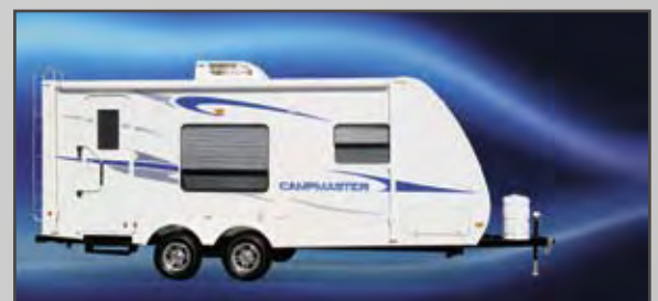
Aerodynamic design with tapered radius skirting and enclosed underbelly increases air flow, improving towability and fuel economy.