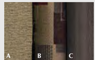
B. Autumn Trail