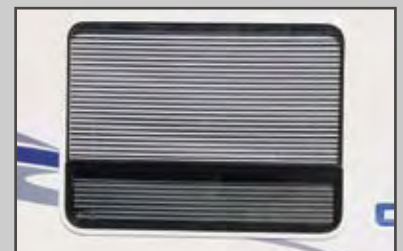
Large dinette window (21RB, 28RDS & 28RLS) improves viewability and increases natural light inside the trailer.