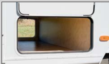
Large pass-thru storage compartment holds lots of gear and makes loading and unloading easy.