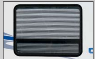
Large windows throughout improve viewability and increases natural light inside the trailer.