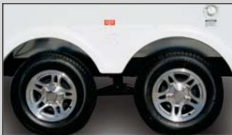
Aluminum wheels enhance the stabilization axle design. EZ lube axles are easy to maintain.