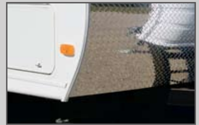
Diamond plate protected front wall adds protection against road elements and adds stylish flair.