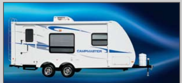
Aerodynamic design with tapered radius skirting and enclosed underbelly increases air flow, improving towability and fuel economy.