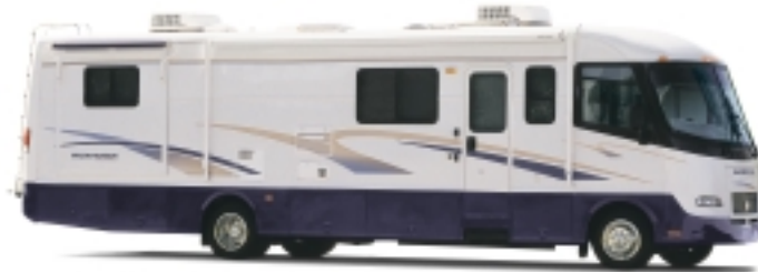
Fawn (V2N01 Fawn interior)