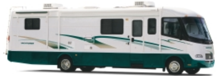
Spruce (V8N01 Spruce interior)