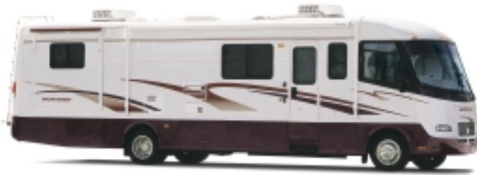
Camelia (V1N01 Camelia interior)