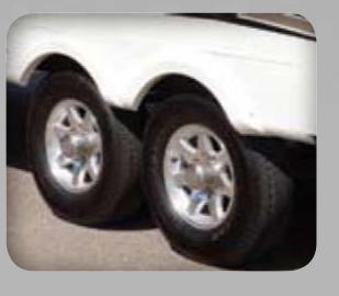
our season camping by Jayco®