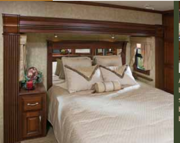
All Escalade Sportsters feature a bedroom retreat with ample hanging storage, 19" LCD TV and designer bedding package. This bedroom will be your place to get away from it all.