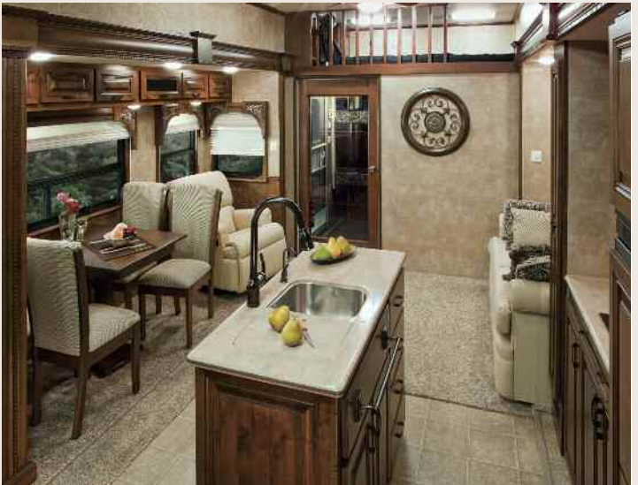
Check it out, this is one elegant toy hauler! The rugged look of distressed, vintage Alder cabinetry, Corian<sup>®</sup> countertops, and residential style stainless steel sink with pullout faucet are just some of the outstanding features. Upper level sleep loft provides additional sleep space.