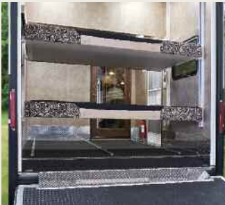
Optional power lift bunks are available in the no-nonsense, built-for-business garage bay. Tough, easy clean flooring with tie down rails make transporting your toys easy.