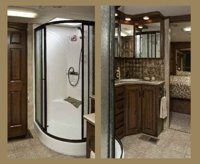
Walk-through bath, complete with full-sized, adjustable height shower head, features a vanity with LED lighting and generous mirrored storage. Pocket doors to both the bedroom and living space provide privacy.