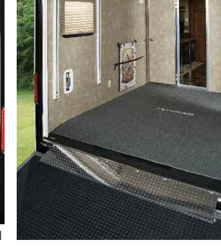
Optional pull down screen wall