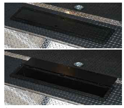
Optional floor storage compartment