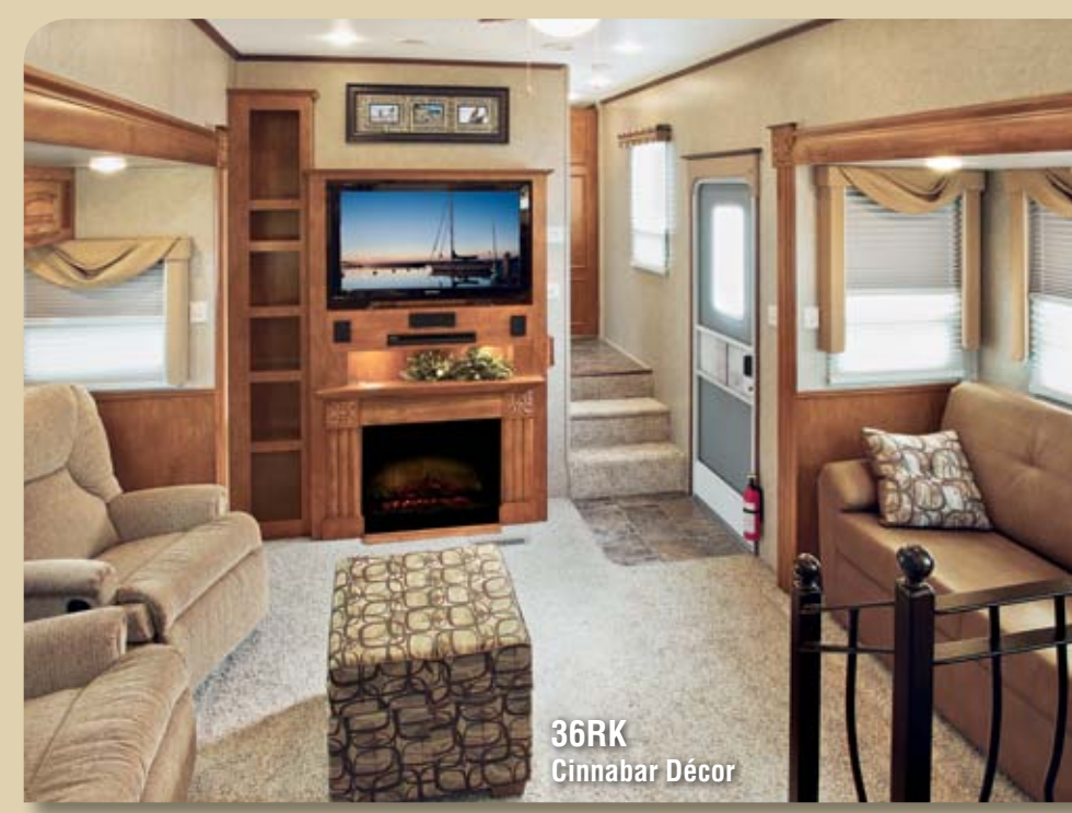
36RK Double slide-outs and tri-level living space allow everyone in the living room and kitchen to enjoy the 40" LCD TV and fireplace. Bookcase and overhead cabinetry provide ample storage.

38FL Featuring an air-bed sofa, recliner, ottoman, large sofa with incliner and two slideouts, this living room accommodates you and your guests. 46" LCD TV, fireplace, hardwood entertainment center and optional MCD roller shades offer the comforts of home on-the-go.