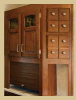
Hardwood cabinetry featuring glazed raised panel doors with appliance garage.