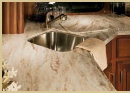
Corian<sup>®</sup> solid surface countertops with accent insert and recessed stainless steel sink.

Standard fireplace surrounded by hardwood cabinetry.