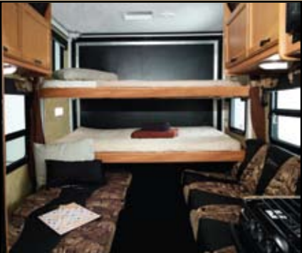
Dual Electric beds provide convenient comfortable sleeping space and store with the flip of a switch.