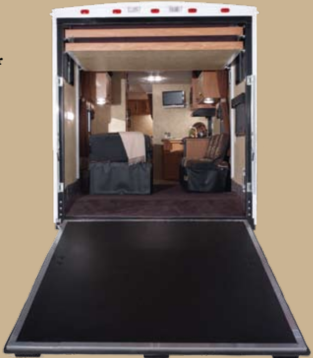
Insulated easy load ramp door is rated at 2500 lbs providing the strength to support most outdoor recreational toys.