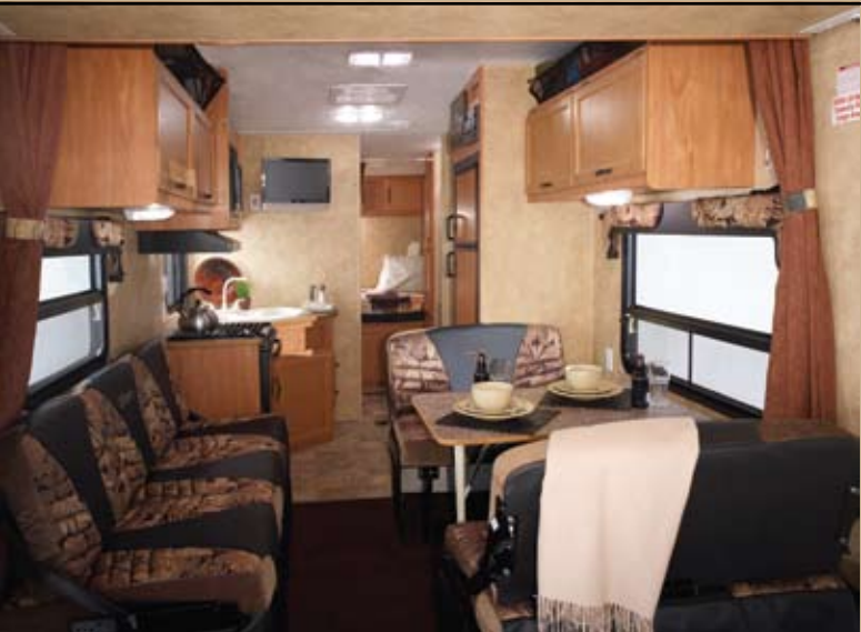
Two tone custom sport seating with an abundance of overhead storage are just two of the many spectacular interior features of the Keystone Energy.