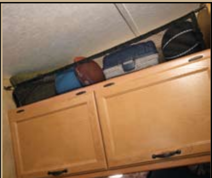
Gear net overhead cargo storage increases capacity by 20%.