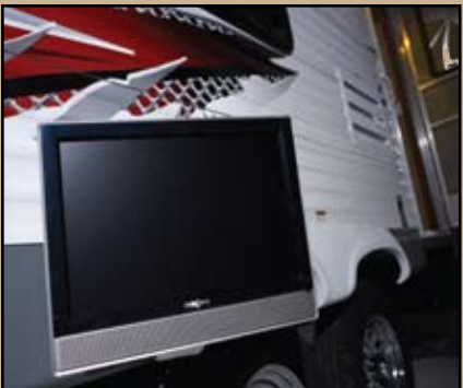
Campsite outdoor theater brings your LCD television alive outdoors!