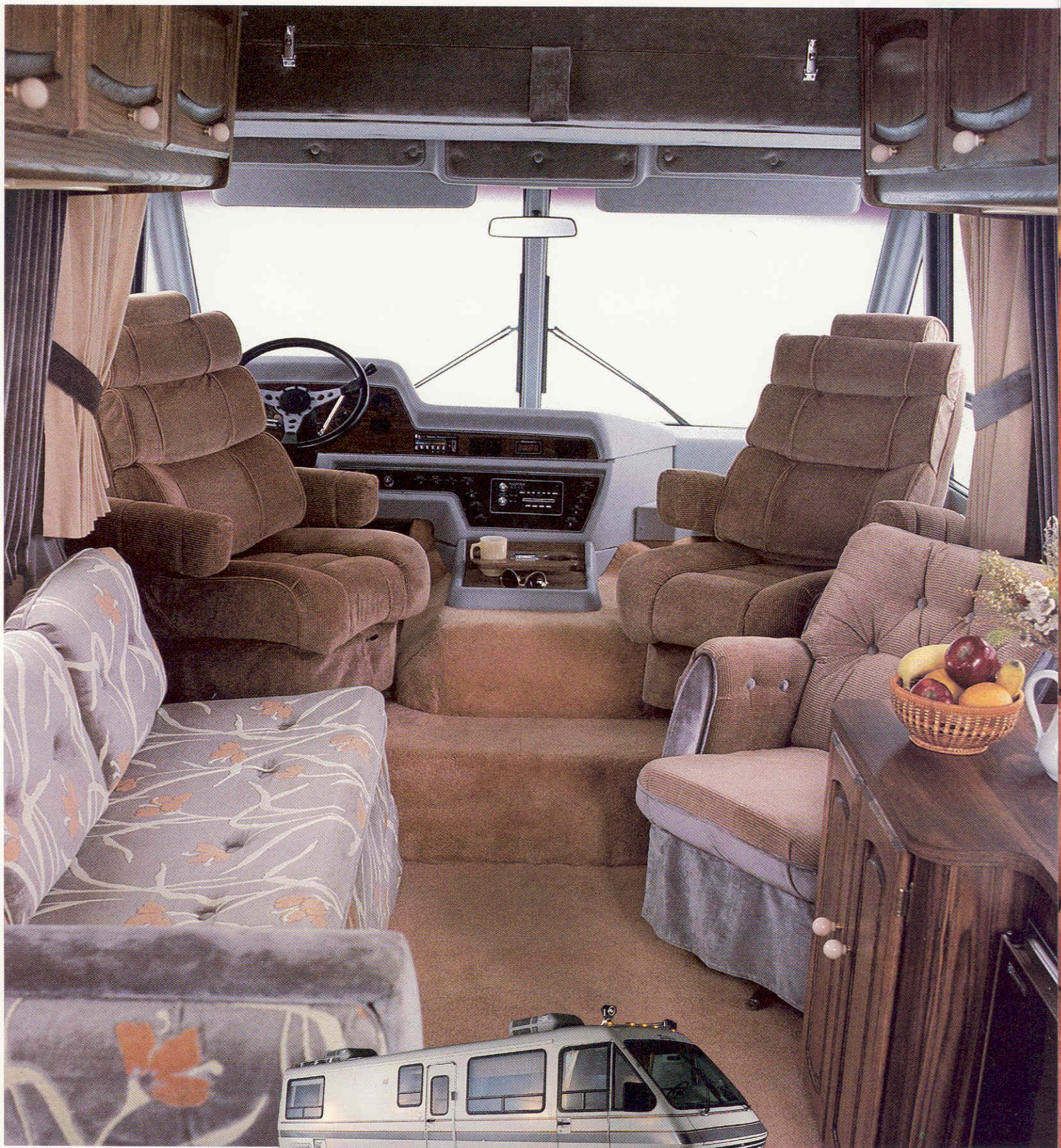
Windcruiser 34RU Lounge and Cockpit