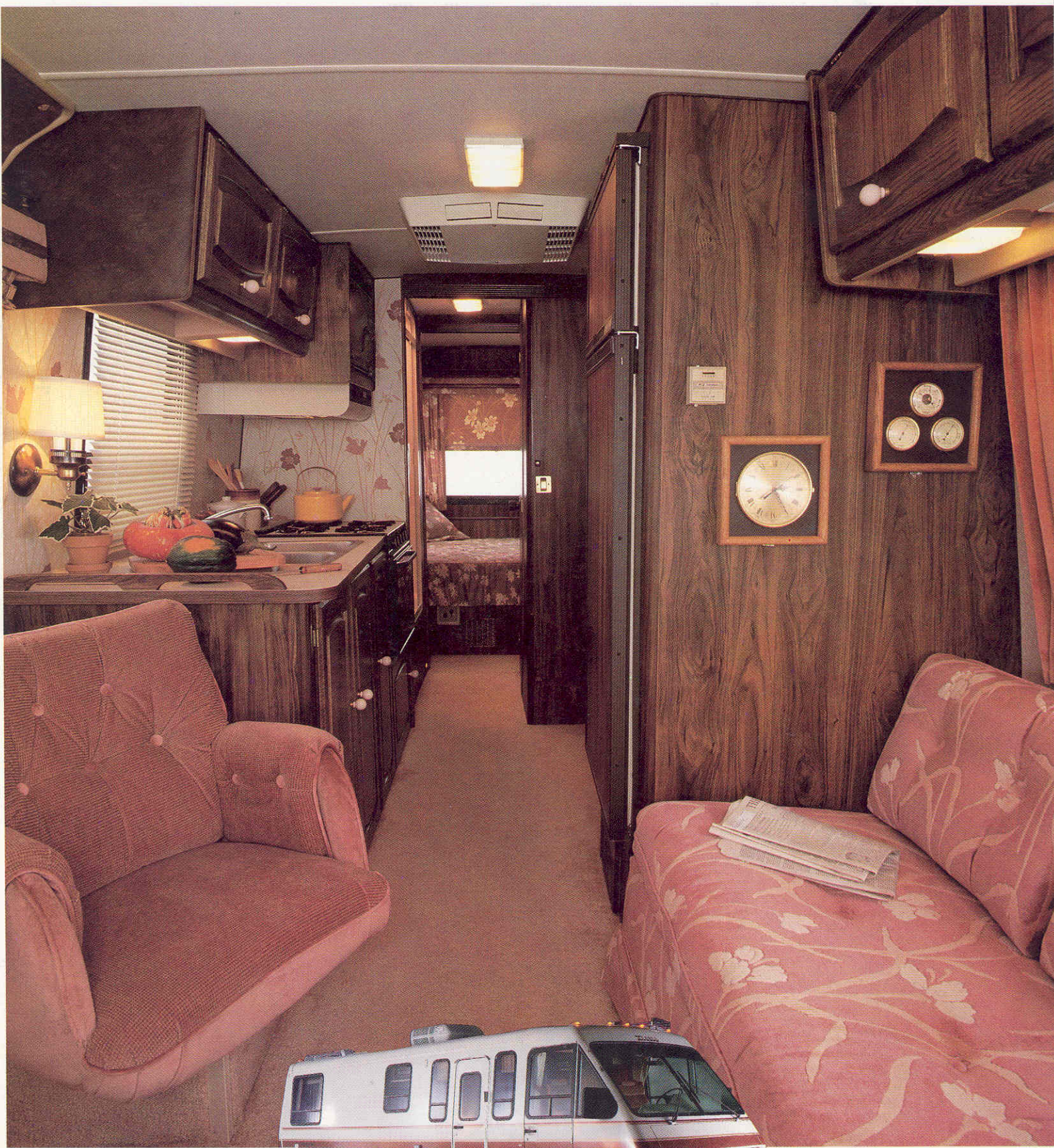
Windcruiser 28RU Galley and Rear Bedroom