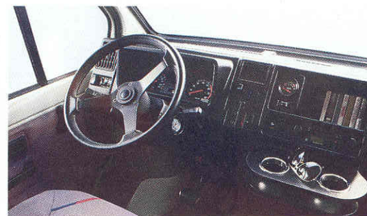
■ The sensibly laid-out dash puts all the gauges within easy sight. It includes an electronic tune/signal seeking AM/FM/cassette stereo and a handy beverage tray.