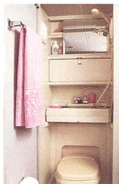
■ The fully-equipped bathroom has telescoping walls to save space.