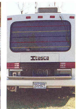
■ The rear cap hides the spare tire and includes additional storage space under a huge window.