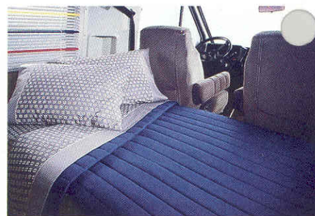
■ Versatility: the companion seats turn into an extra bed.