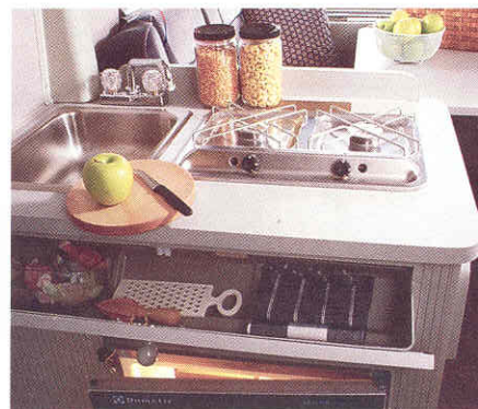
■ The complete galley features a stainless-steel sink, two-burner range and refrigerator.