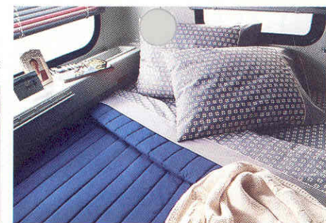
■ The dinette quickly converts to a double bed.

■ Chassis dipped in primer and sealant tanks to cleanse and rustproof