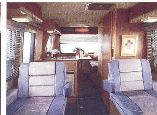
■ A family car with bathroom, galley, dining room, living room, and beds for four—the 220RD.