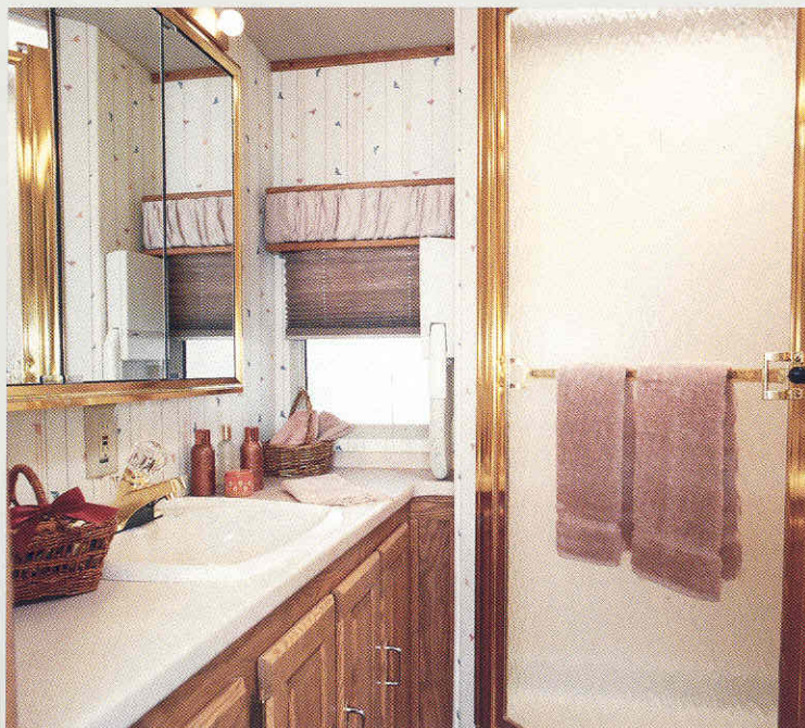
Standard bathroom features: over-size shower with brass-tone shower head and height adjusting bar; porcelain marine toilet with sprayer; extra large sink with overflow and lift-up stopper; Nutone® hair dryer with auto-on, brass-tone hand rails and towel racks in the shower; medicine cabinet with triple-fold mirror; storage cabinet above the toilet.