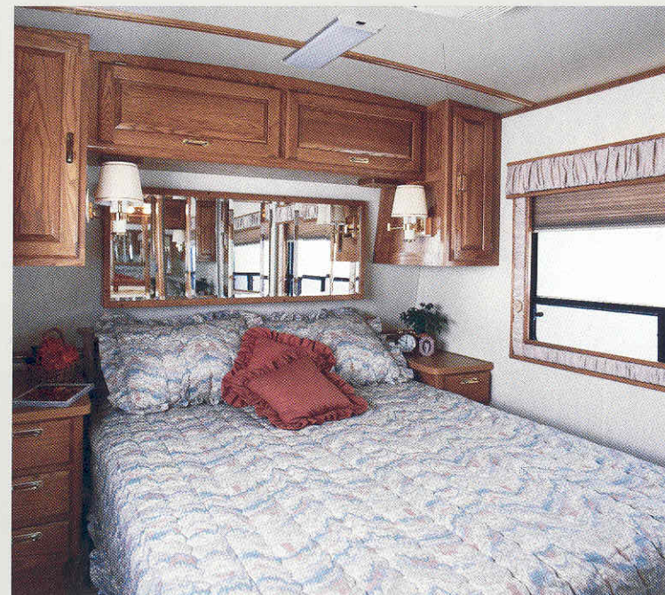
Standard bedroom features: AM/FM/cassette stereo, 9" remote control color TV with tambour door TV compartment, storage beneath the Sealy® Posturepedic queen bed that can be accessed with the assistance of lift-up cylinders, large walk-in cedar-lined closet with drawers, sliding dividing door to close off bedroom, lit and mirrored makeup table includes a drawer with dividers and a brass-tone tissue holder.