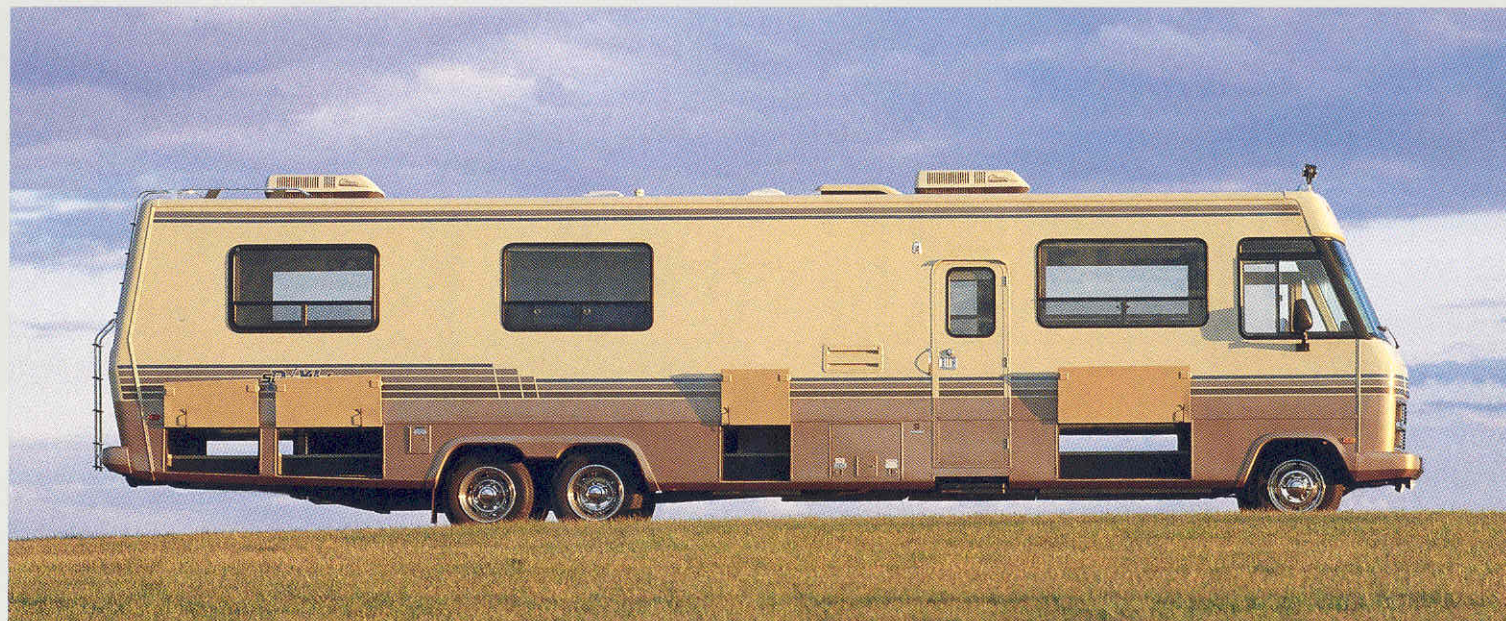
Standard exterior features: single-piece Thermo-Panel® fiberglass sidewalls, locking storage doors, exterior entrance light, electric entrance step, crowned roof, fiberglass rear cap with spare and additional storage, tag axle, radial tires, aerodynamic mirror fairings, electrical outlet, luggage rack with ladder.