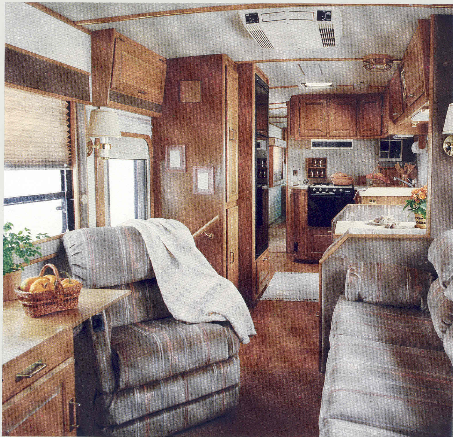
Standard features of the spacious interior: oak parquet galley floor, Avonite® counter top, 13" color TV in the living room, swivel chair w/footrest, roll-out drop-leaf table, glass door, door activated cabinet lights, microwave/cabinet at eye level, decorative dinette ceiling light, knife and spice racks, kitchen "lazy susan," padded vinyl ceiling.

Every Winnebago owner is invited to join the Winnebago-Itasca Travelers (W.I.T.) Club. Members enjoy rallies and caravans, receive special discounts and services, make new friends and renew old acquaintances, and, of course, have the time of their lives. For more information, call W.I.T. at (515) 582-6874.