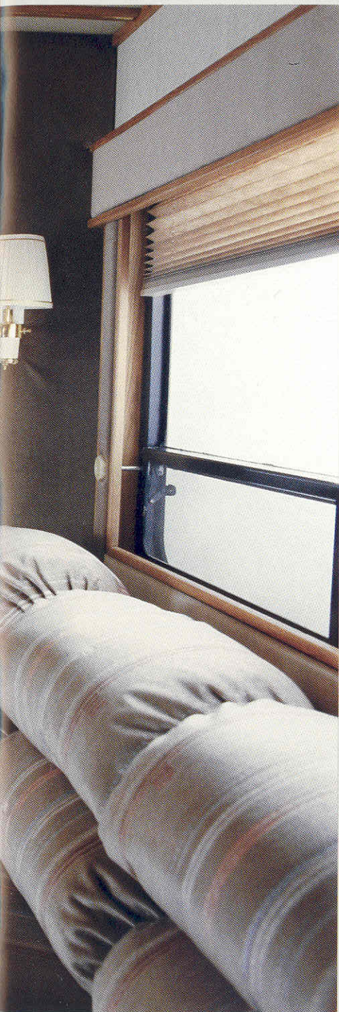
able, entrance door closet, hutch with decorative ing w/oak trim and telephone ready with two jacks.