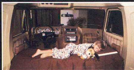
Warrior offers extra sleeping capacity in the optional Youth Bed. A pull down bunk is also available.

Clearly, Warrior sets the pace for an entire industry to follow. Not just because it's the most advanced motor home you can buy. But also because it's built to be a Winnebago. The number one motor home in America.