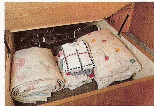
Hidden bedroom features include lots of storage thanks to a gas/piston lift bed storage compartment with a finished bed base inside and out.