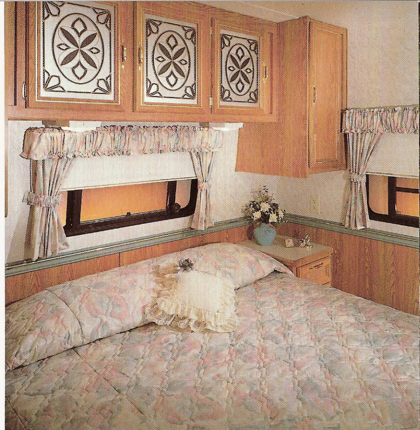
A Queen-size bed and bed spread are among the many standard features you'll appreciate.