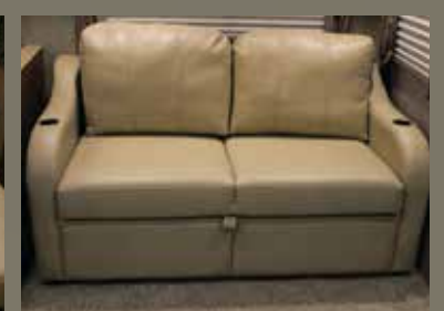
The Flex Bed System allows you to easily convert the tri-fold sofa into a double bed with no air mattress to go flat and no springs or bars in your back.