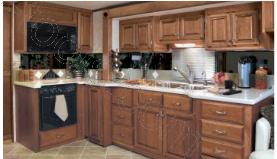
40 C Shown with Topaz interior & Natural Walnut wood

Throughout Revolution options rule! You can choose from nine stunning wood and fabric combinations, and rich, ultraleather furniture with color-coordinated inserts. Quality Fabrica® carpet and luxurious vinyl-padded ceilings will make our spacious living area one of your favorite vacation spots. And the optional, centralized, power-vacuum system makes housekeeping quick and easy, because we know you've got better things to do.