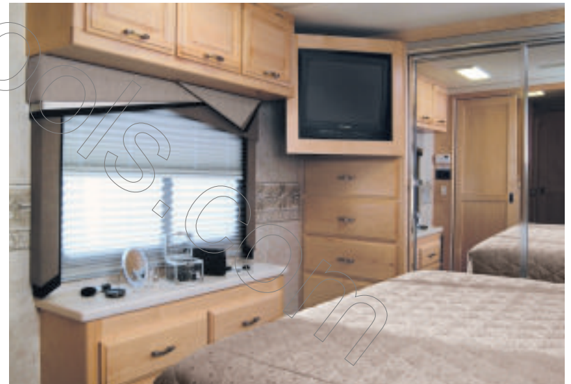
38 B Bedroom shown with Onyx interior and Clear White Maple wood.

In the bedroom, we've provided storage, storage and more storage! If you want to bring it, we're sure it will fit into the full wardrobe, spacious overhead compartments or the optional base cabinet. You'll also appreciate the large 20" television conveniently mounted on a handy swivel base, beautiful Corian® nightstand tops, and pleated day & nightshades.