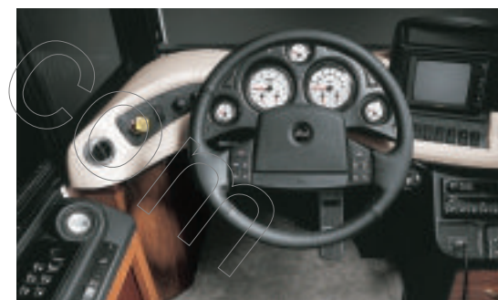
38 B Shown with Onyx interior & Clear White Maple wood.

Driving Revolution will definitely appeal to your independent spirit. You are in complete control with a wide array of standard features including DSS Trackvision, upgradeable to the In-Motion DSS System, adjustable foot pedals, rear vision camera and monitor package, and European styling all around. Our Smart Steering Wheel is a steering column that tilts, telescopes, and has a gauge panel to give you maximum comfort while driving. And we've put control of headlights, wipers, cruise control, power sun visors and sound at your fingertips.