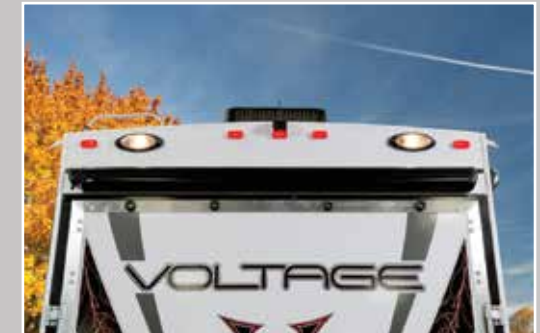
3895 Rear Camera and Lights