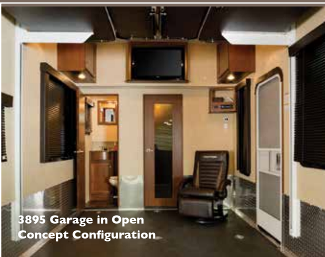
3895 Garage in Open Concept Configuration