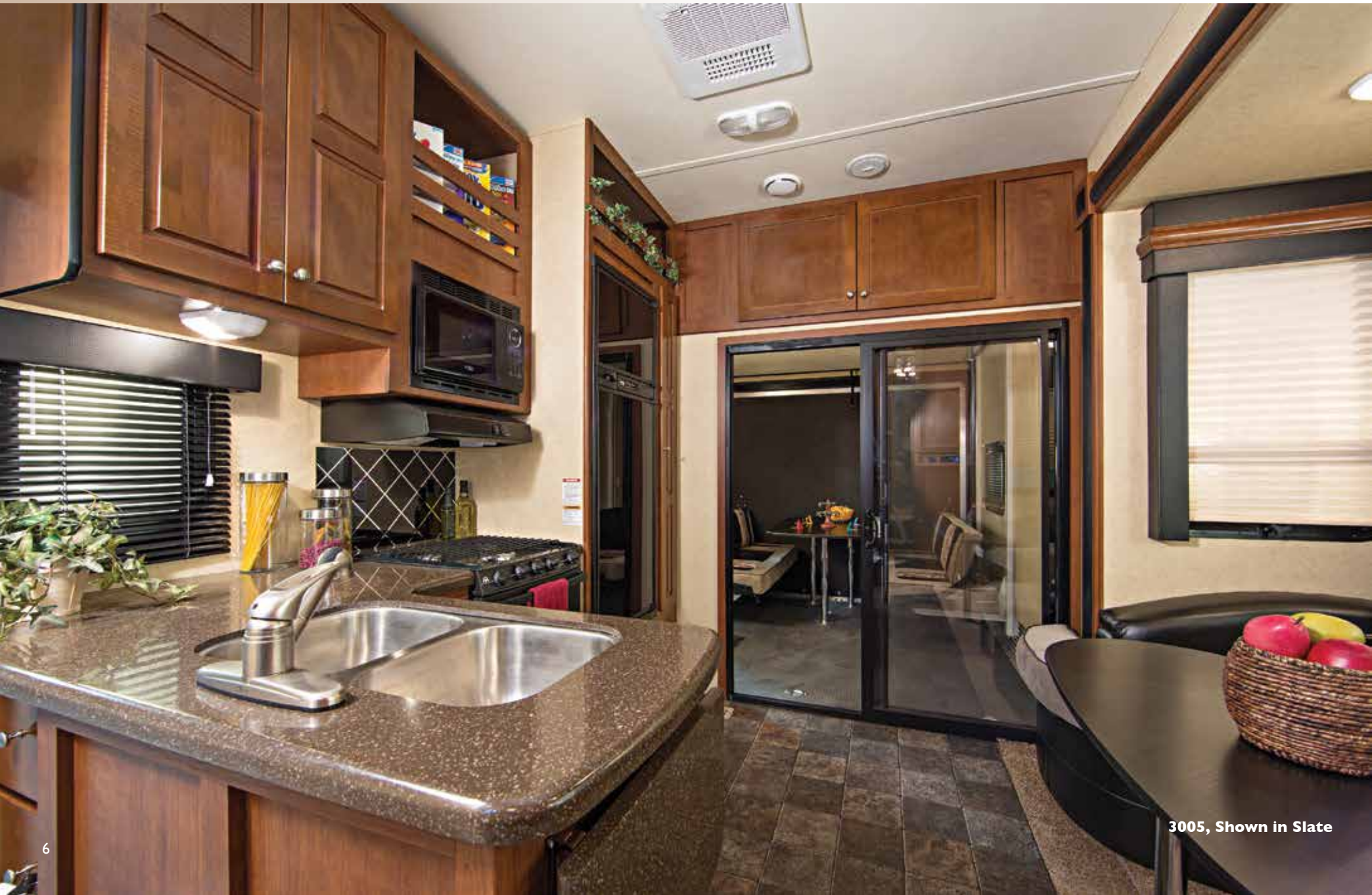
3005, Shown in Slate

Voltage V-Series toy haulers offer a whole lot of trailer for the money. We give you all the necessities and conveniences of home, including solid surface countertops, comfy furniture with storage features, quality kitchen appliances, stainless steel double-bowl sink, and well-designed storage areas.