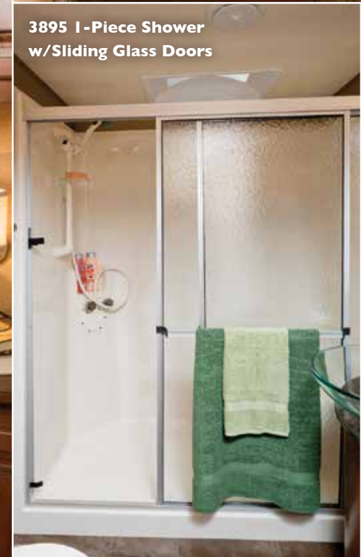
3895 I-Piece Shower w/Sliding Glass Doors