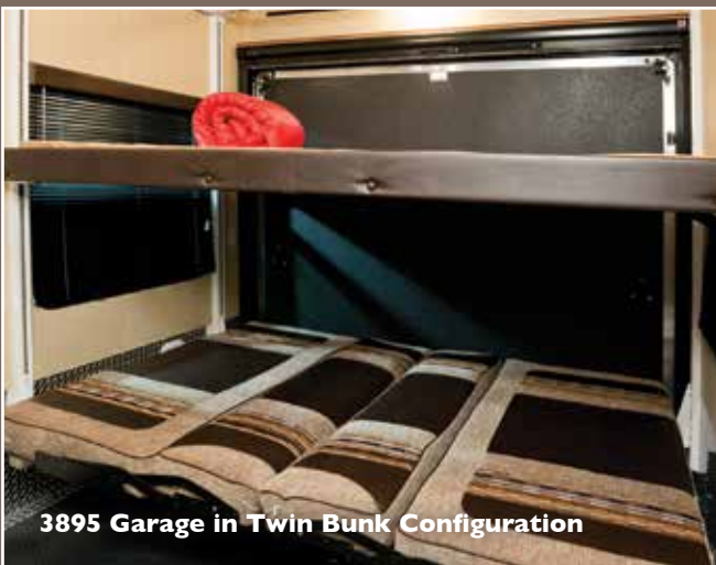
3895 Garage in Twin Bunk Configuration