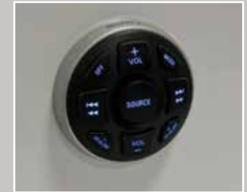
3895 Exterior Sound Control