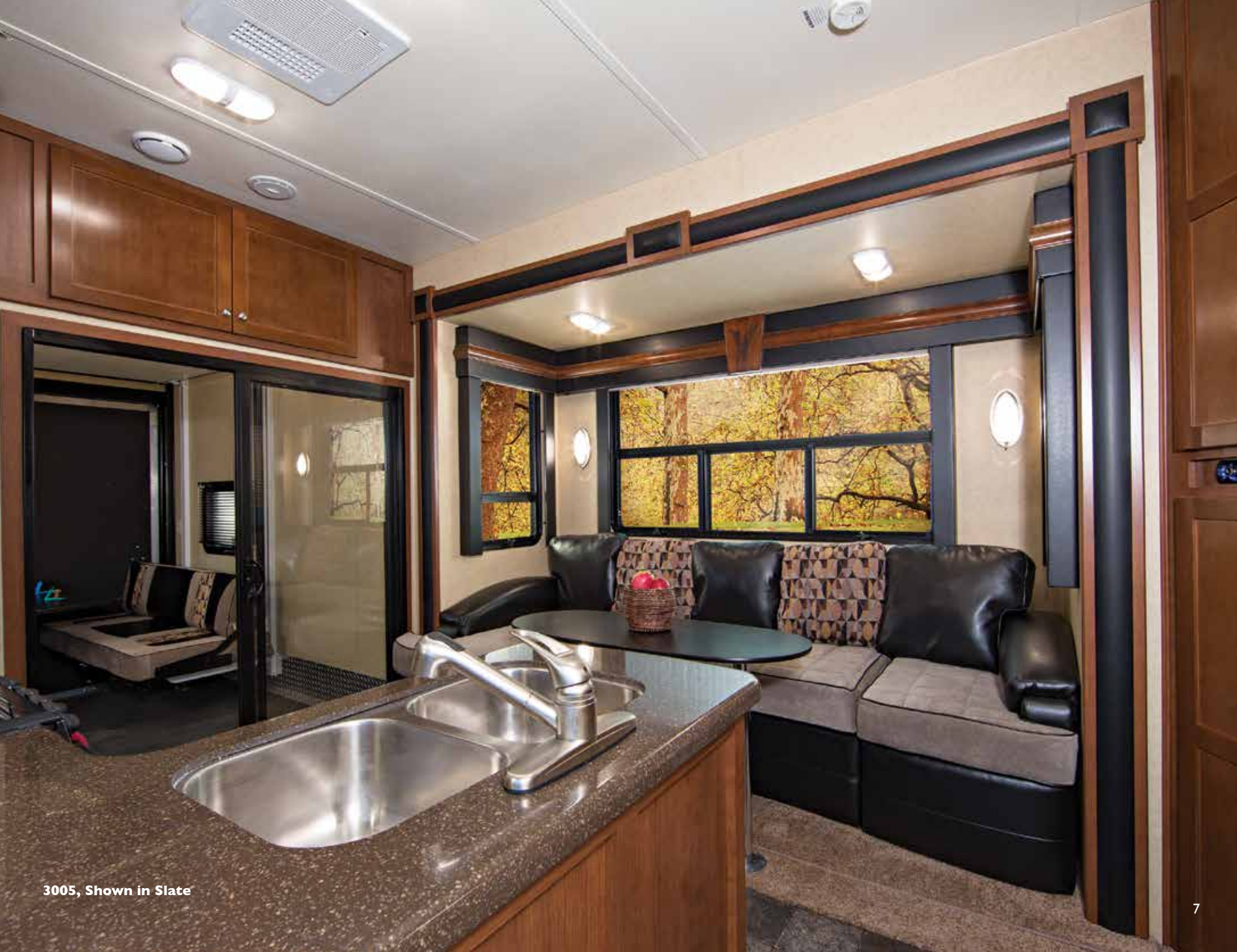
3005, Shown in Slate