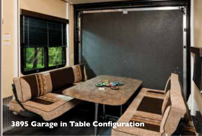
3895 Garage in Table Configuration