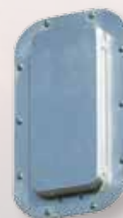
DUAL RAM-AIR CARGO VENTS