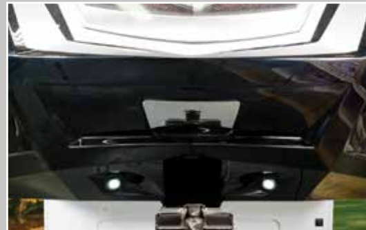
3895 Exterior Docking Lights