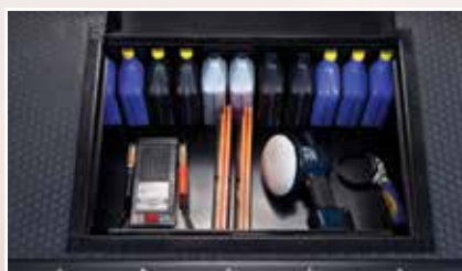
DOVETAIL STORAGE BOX