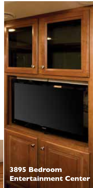
3895 Bedroom Entertainment Center

Voltage executive bedrooms offer an incredible amount of spaciousness. Puff up your pillows, sink into our full-sized residential mattress, flip on one of several reading lights, crack open that book you've been dying to start and relax! Other features include 120V outlets on each side, generous storage areas, adult-sized mirrors and huge wardrobes.