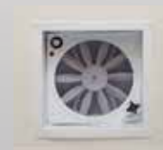
CARGO AREA POWER FAN