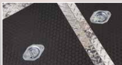
2,500 LB FLUSH FLOOR TIE-DOWN RINGS