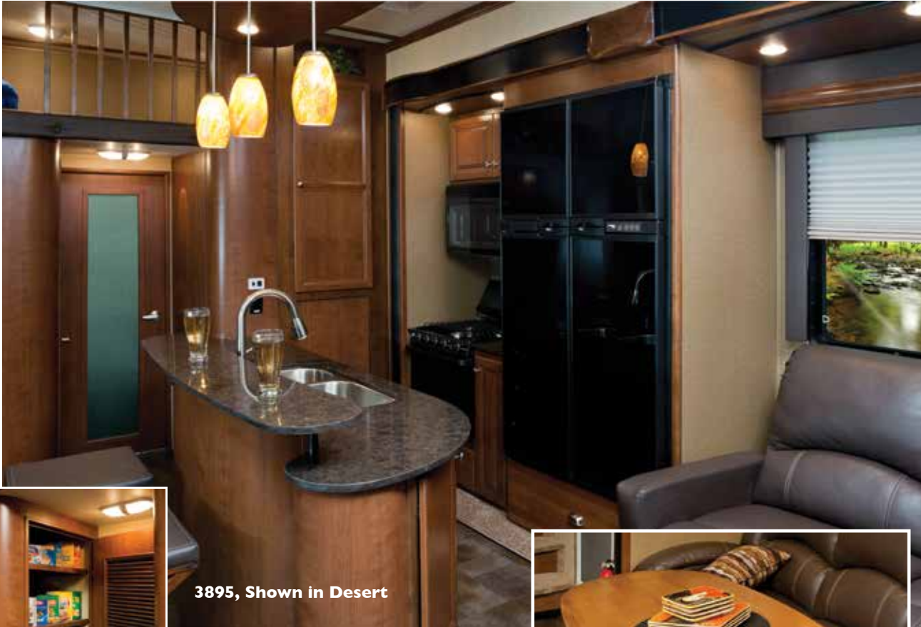
3895, Shown in Desert

Voltage toy haulers are designed, developed and produced by professionals who not only take pride in their work, but actually care about their customer's experiences when using our products! Your family and friends will move seamlessly from room to room and activity to activity because of the time we've spent planning the use and flow of each space.