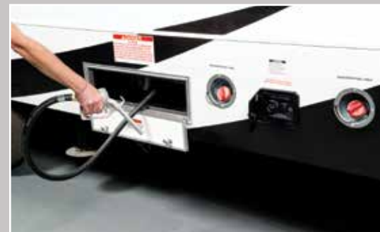
3895 Fueling Area