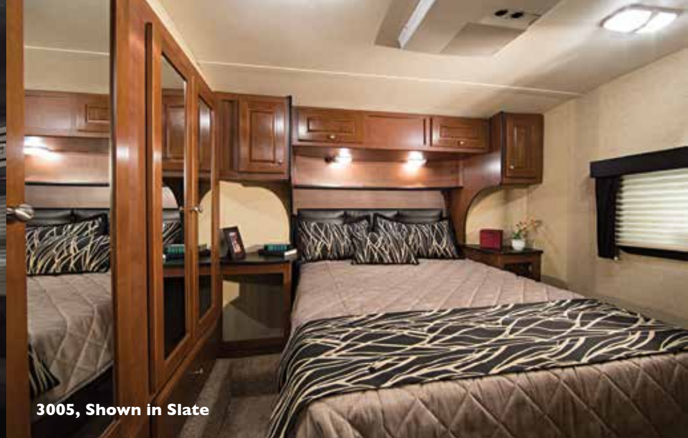
3005, Shown in Slate

Bedrooms offer serenity and space. Our engineers utilized the entire depth and width of the front cap area for increased bedroom square footage. Not only does this make for a beautiful and restive space, but you'll be amazed at the amount of storage it allows.