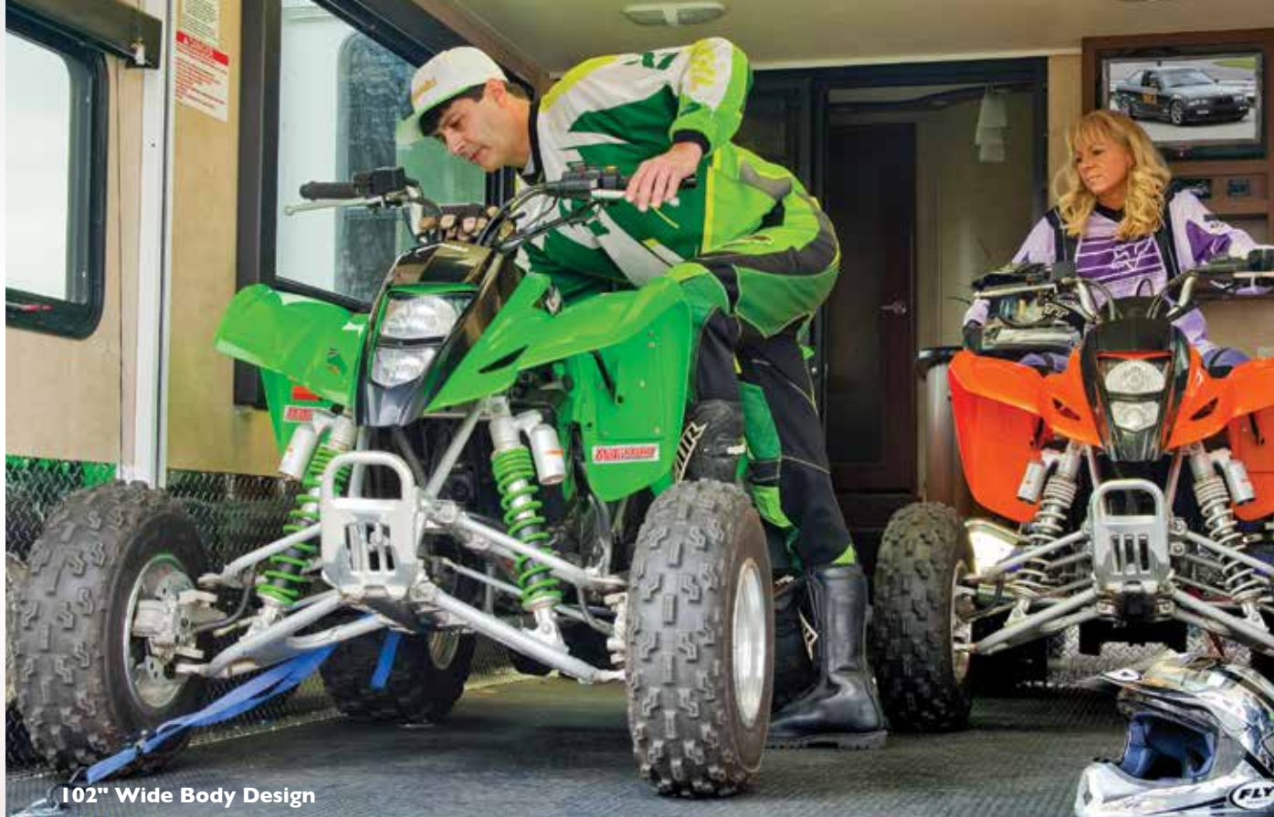
102" Wide Body Design

Non-slip chemical and UV resistant Tuff-Ply flooring, 2,500-pound tie-down rings, 22" diamond plate, heat and AC ducts, and metal ram-air vents are all standard features.