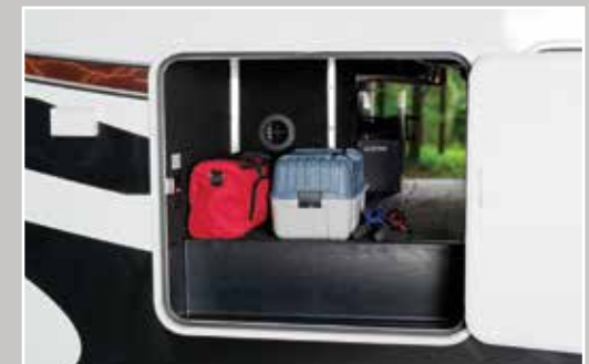
3895 Pass Thru Storage