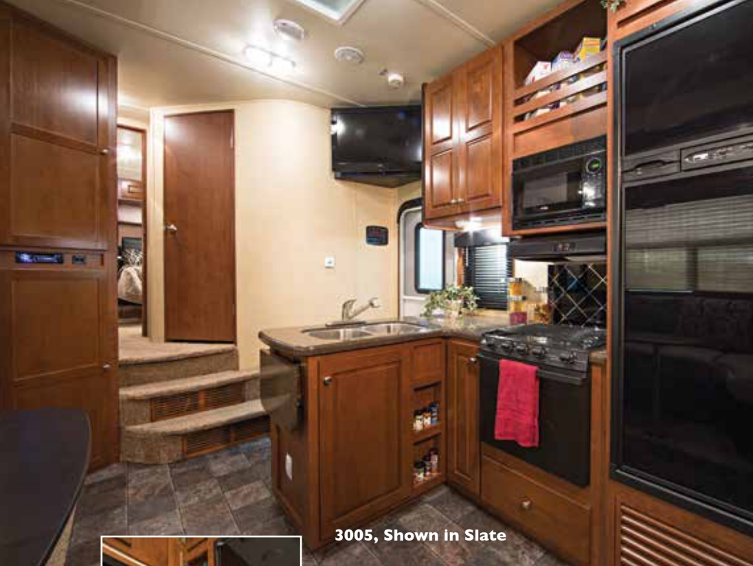
3005, Shown in Slate