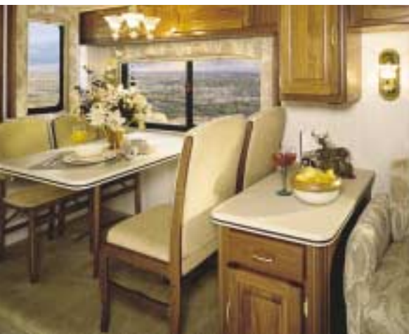
9400 DINETTE IN HYDRANGEAS DECOR ▲

let you keep an eye on all the chassis' systems. They are easy and safe to read day or night as well. Both the pilot and co-pilot can travel comfortably in the Islander's luxurious Flexsteel captain's chairs that feature easy-to-use remote function controls and a high level of comfort. As an added bonus, the co-pilot can really enjoy any trip with the convenient electric footrest.