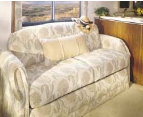
9400 LOVESEAT IN HYDRANGEAS DECOR (OPTIONAL) ▲

gravity. This system results in an impressive balance of handling stability and refined ride quality—something yet to be achieved by other chassis. This deluxe chassis system also provides a tremendous amount of pass-through basement storage space. Add the standard Neway independent front suspension and you'll see that others don't even stack up.