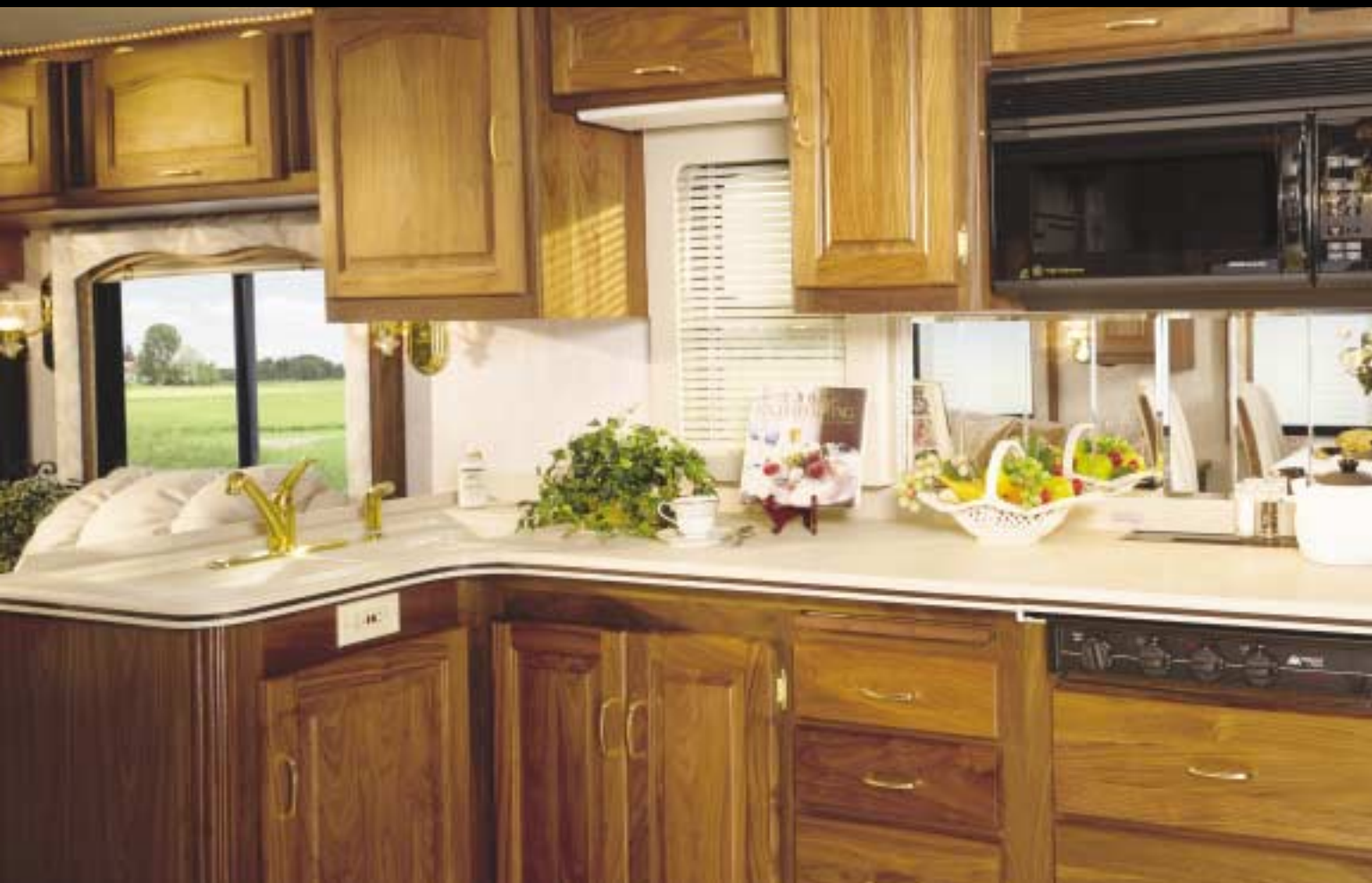
▲ 9400 IN CRYSTAL DECOR