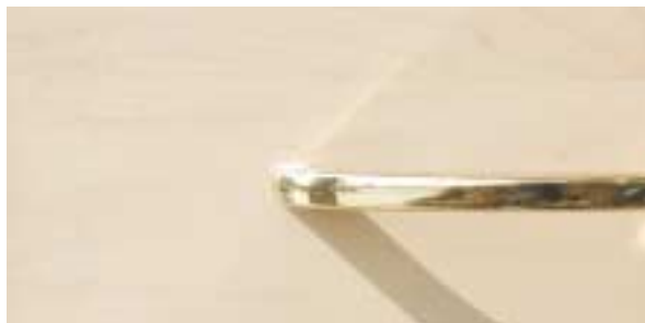
OPTIONAL MAPLE ▲