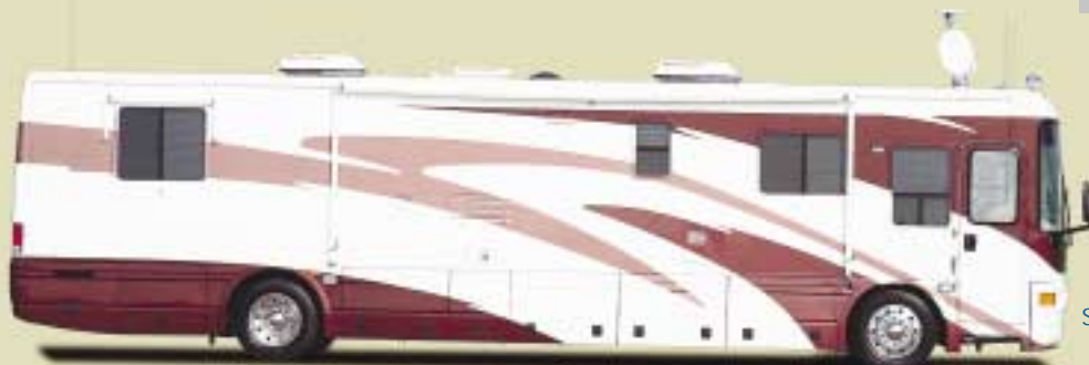
SUNSET BURGUNDY PAINT OPTION