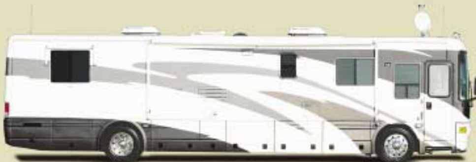
DESERT BEIGE PAINT OPTION