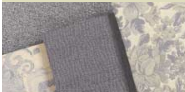
PACIFIC BLUE ▲