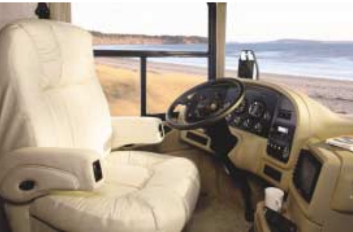
9400 COCKPIT IN HYDRANGEAS DECOR ▲

National RV is proud to introduce the Islander luxury diesel pusher motor coach. The result of a collaborative effort between sister companies National RV and Country Coach, the Islander will change the way you view luxury diesel pushers forever. The Islander is packed with features not found in coaches costing thousands more. There's a term for that: Value. It's a term not typically used when talking about luxury coaches but after you've had the chance to explore an Islander, we're sure you'll know what we mean.