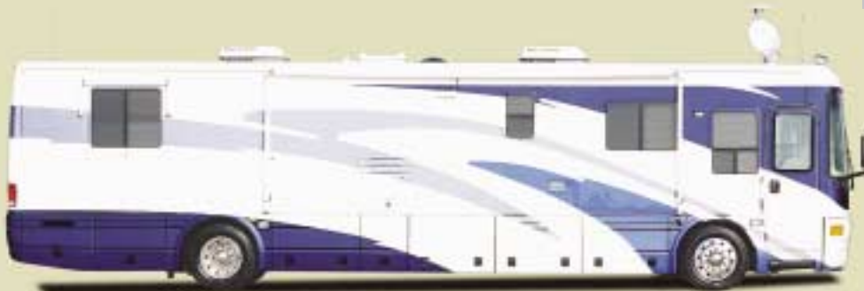
OCEAN BLUE PAINT OPTION