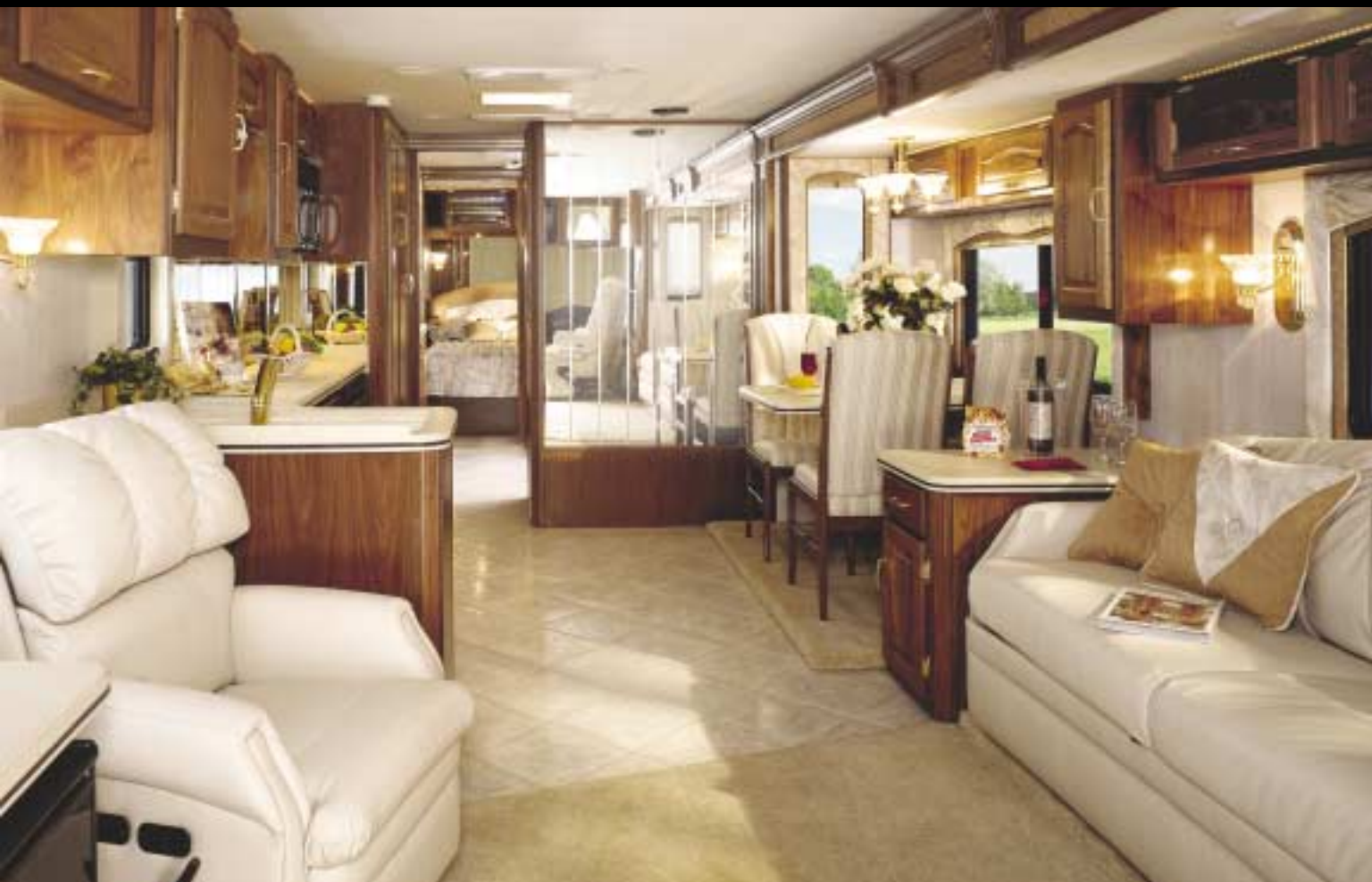
▲ 9400 IN CRYSTAL DECOR