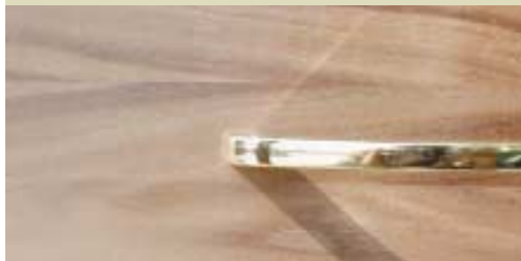
OPTIONAL WALNUT ▲