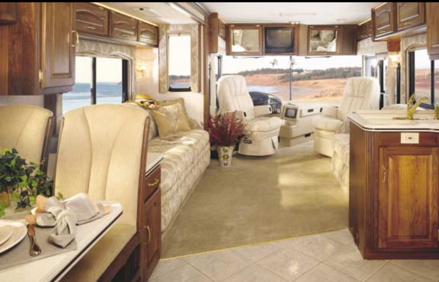
▲ 9400 IN HYDRANGEAS DECOR