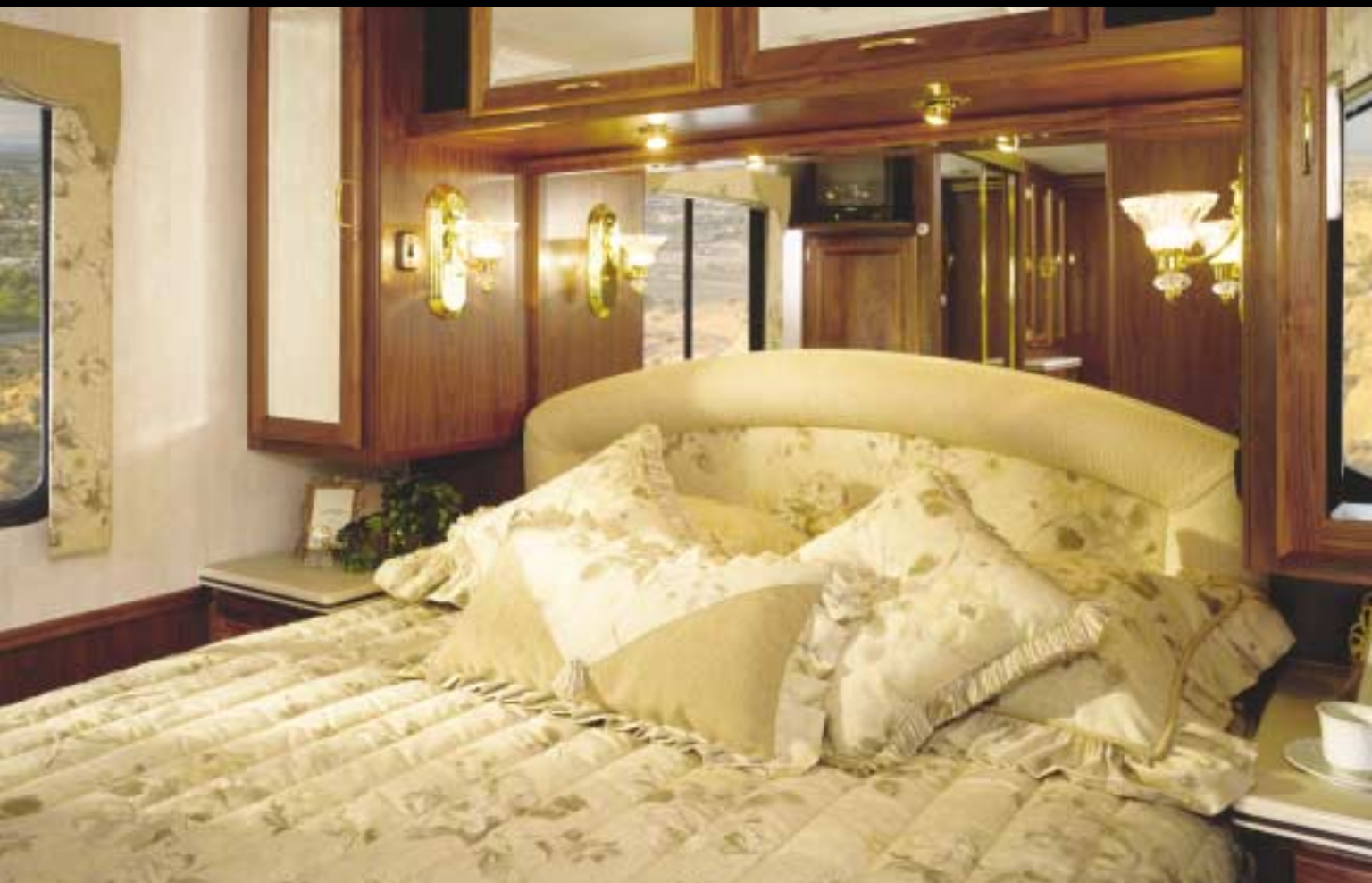
▲ 9400 IN HYDRANGEAS DECOR