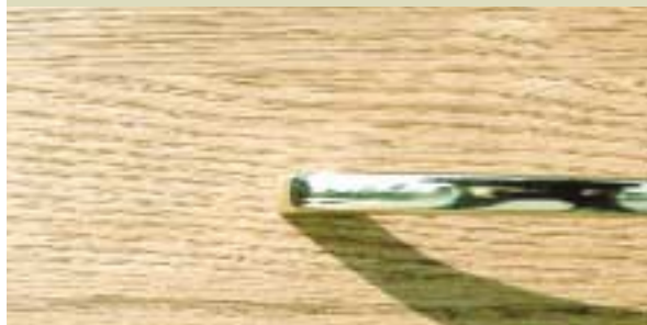
STANDARD PRAXIS OAK ▲