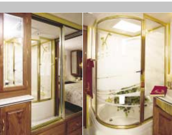
9400 CIRCULAR GLASS SHOWER ENCLOSURE ▲

Islander offers an assortment of hand crafted solid hardwood cabinetry. Whether you choose warm oak, rich walnut or lavish natural maple cabinetry, you can rest assured that your investment will maintain its stunning appearance for years to come. We've also designed special fluted corner moldings out of solid hardwood to giving the Islander an especially rich look and feel. Of course all surfaces throughout the Islander are designed with custom fitted Dupont Corian® solid surface tops—not cheap imitations—that are the most practical and beautiful counters you can own.