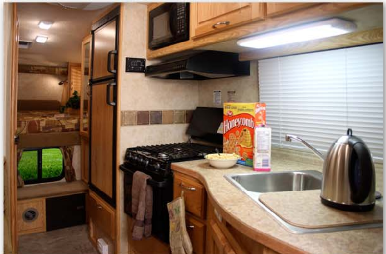
▲ Galley and Bedroom