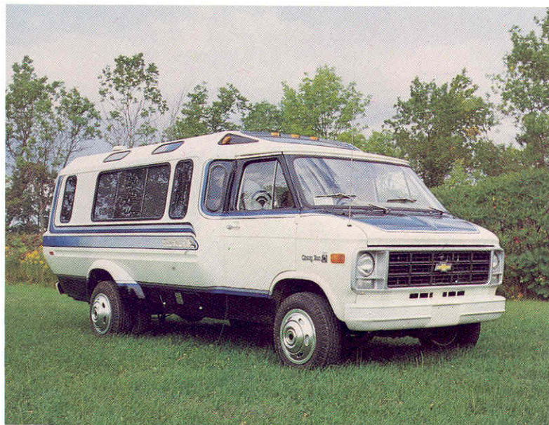
The look of a new breed . . . the aerodynamically styled Seahawk shown here with optional dual wheels and vista windows.