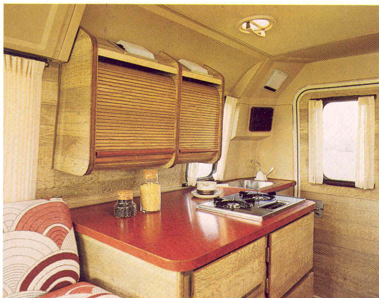
Functional, compact galley provides roomy over head cabinets and the built-in convenience of an ice box and optional stove.