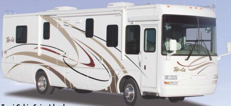
Tropi-Cal in Spice Island