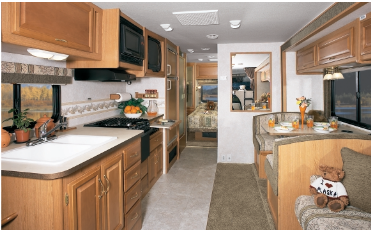
TIOGA SL 31W LIGHT PRAIRIE TAN